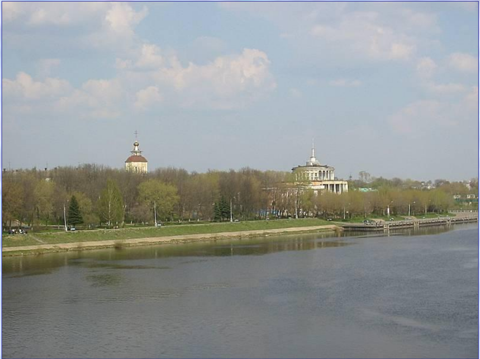
The Volga river