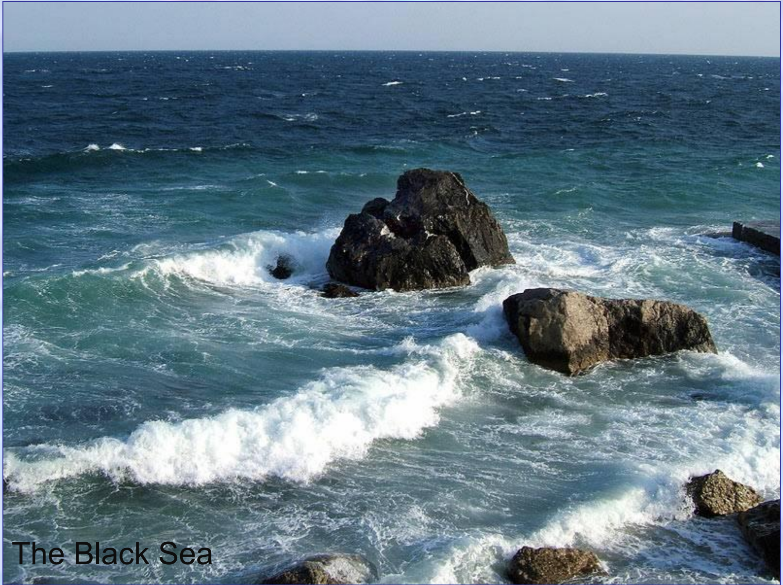
The Black Sea