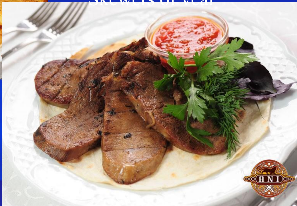
Skewers of veal