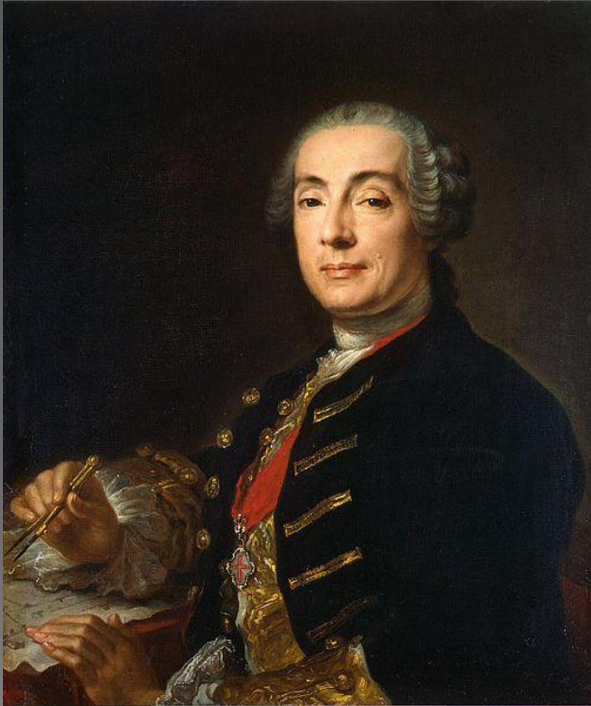
Portrait of Count Rastrelli painted by Lucas Conrad Pfanzelt (1716–1788)