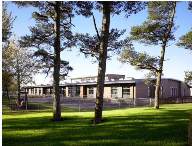
Green Hill primary school