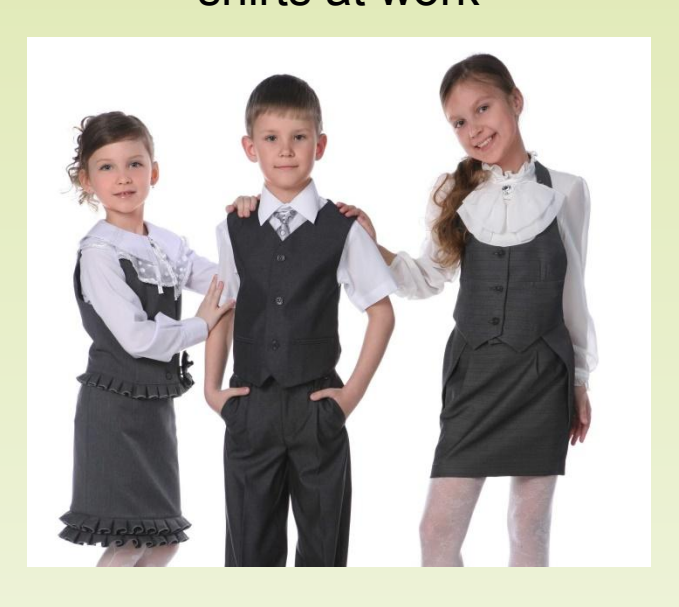
Pupils don't like to wear school uniform