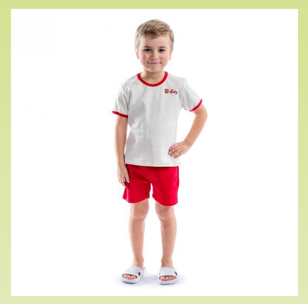
Children have on shorts and T-shirts in summer