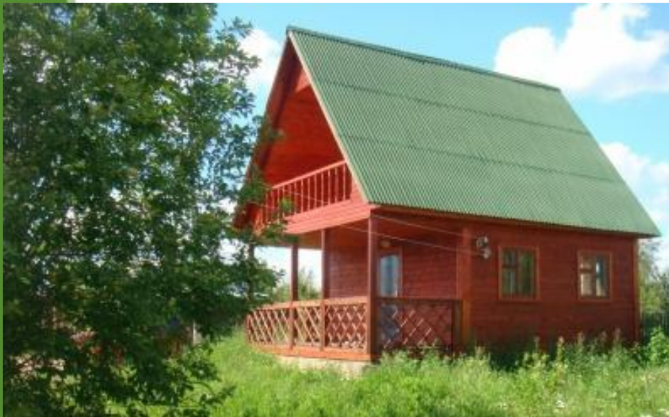
a country house