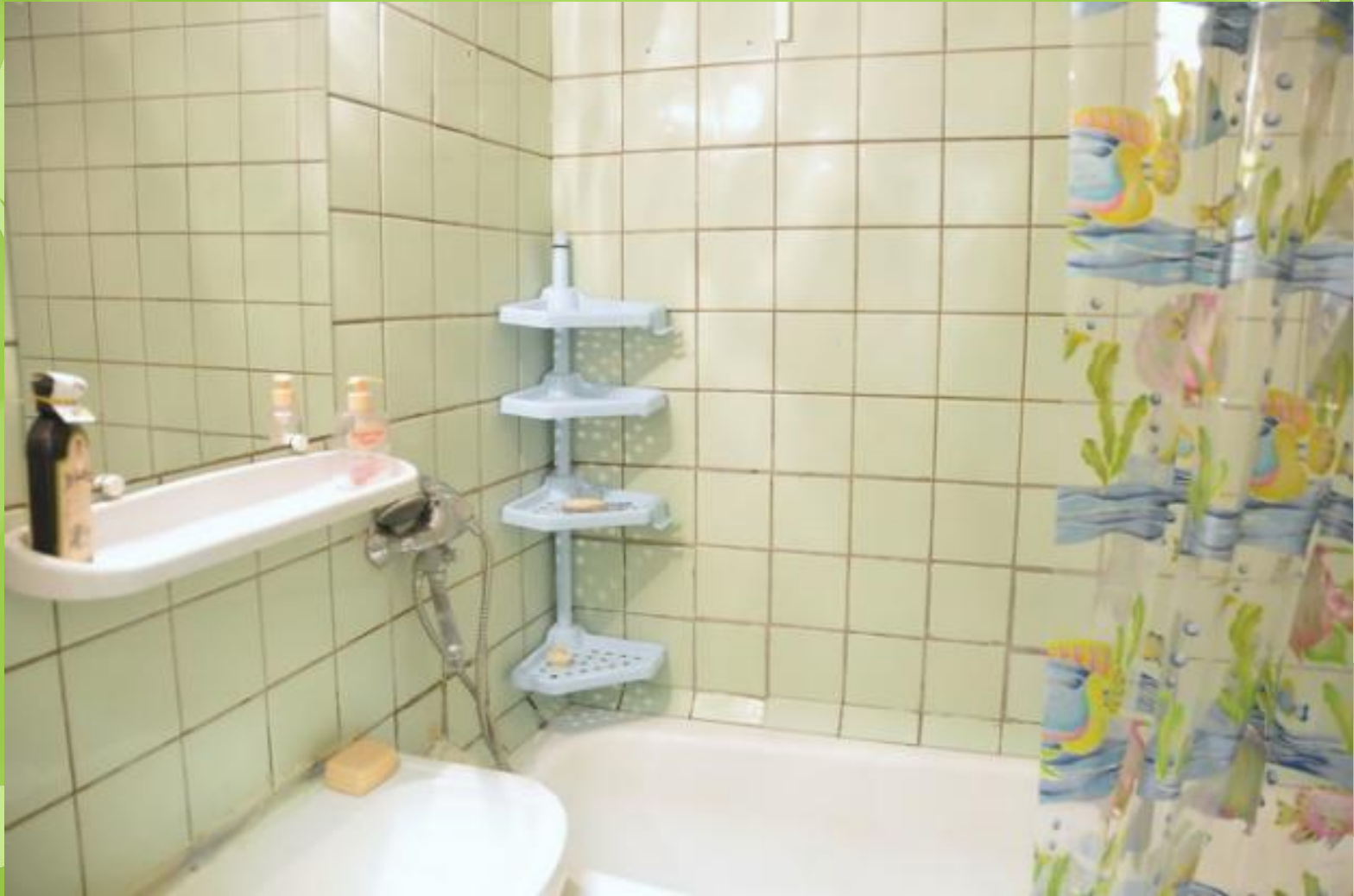
A bathroom with a bath, a shower and a mirror.