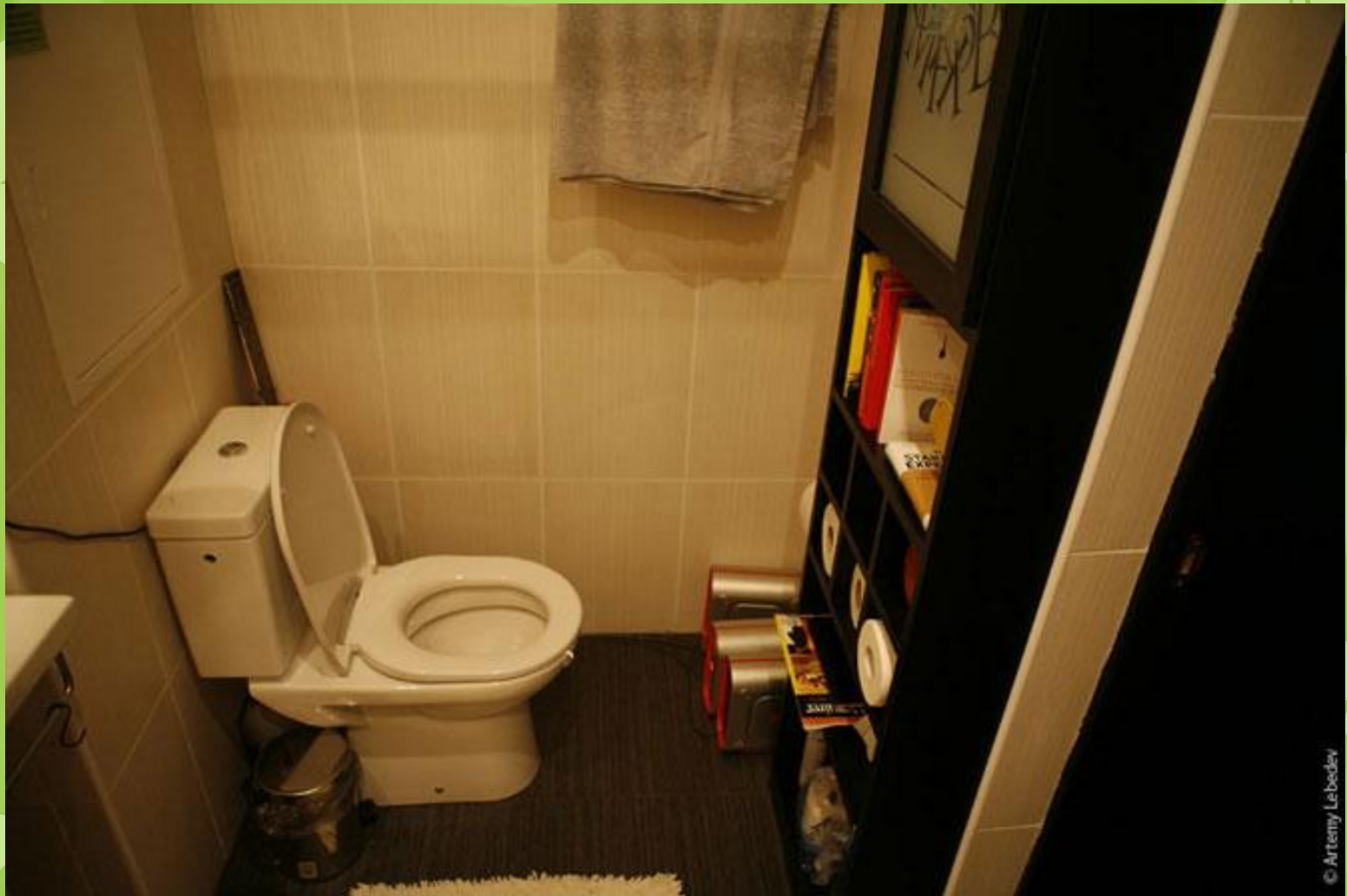
A lavatory with a toilet bowl, a washbasin and a shelf for toilet paper.