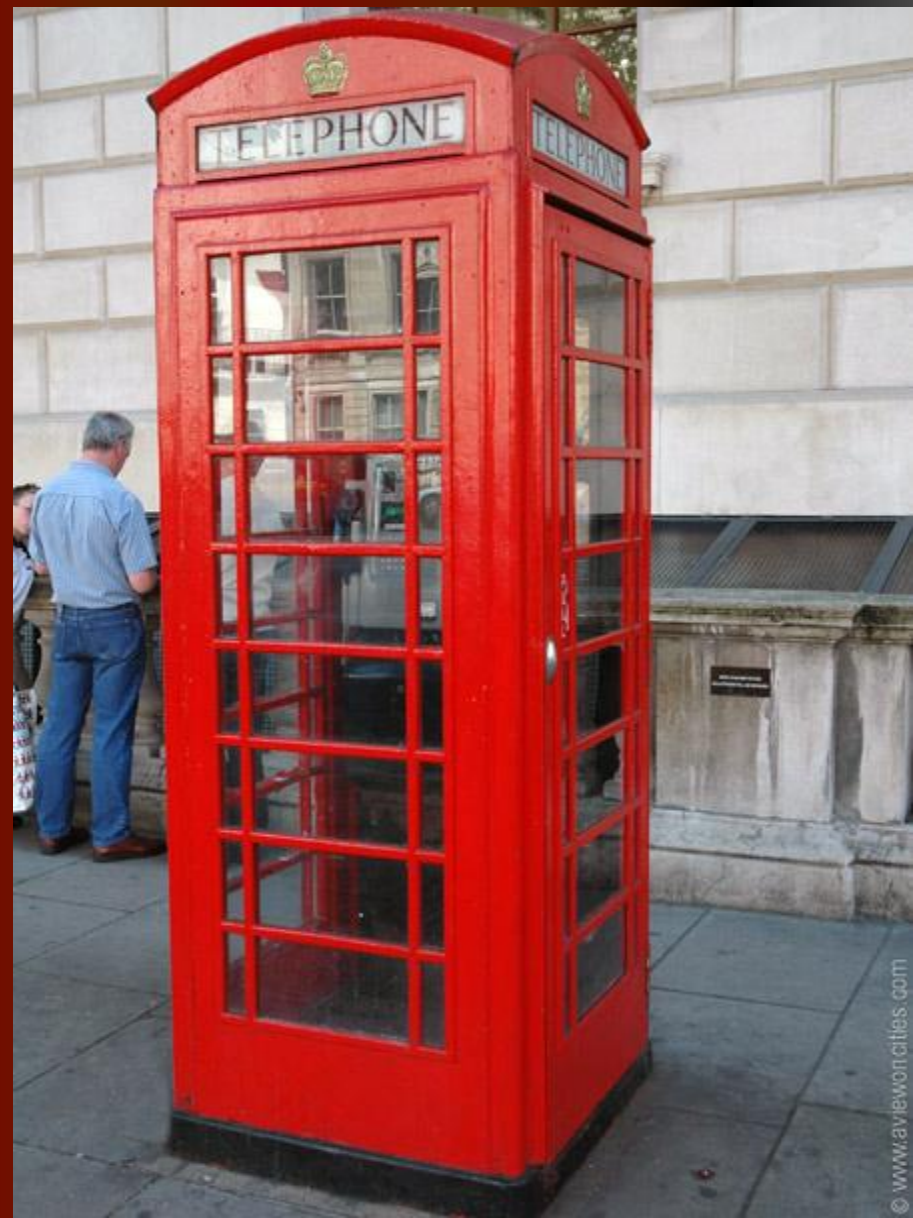
London Telephone Booth