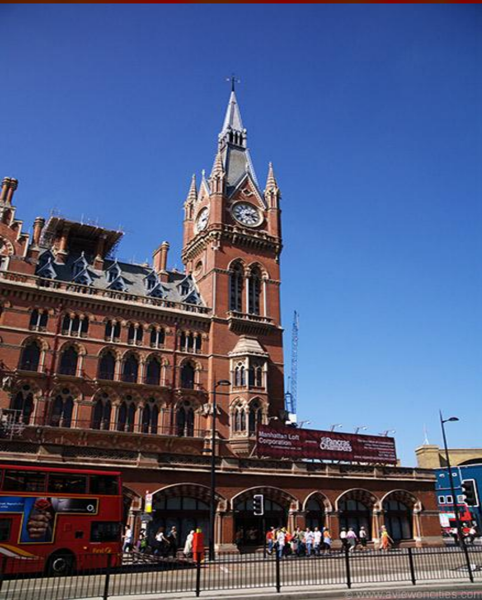
● St. Pancras Station