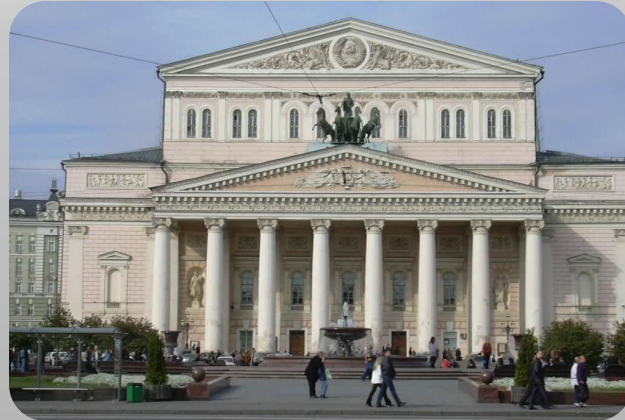
The Bolshoi Theater