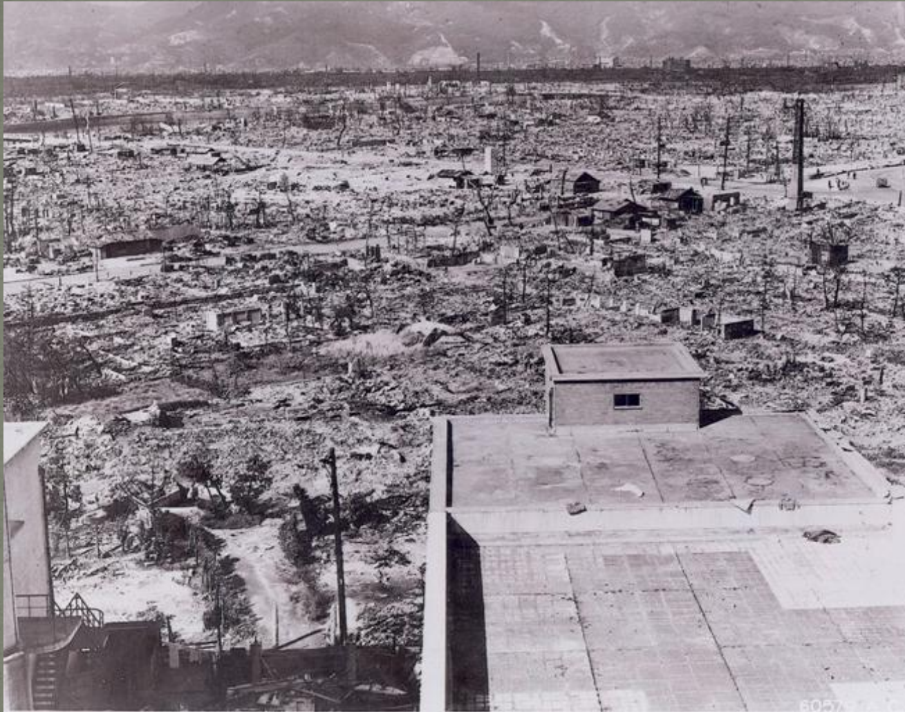
On the 6 th of August US dropped atomic bomb on Hiroshima