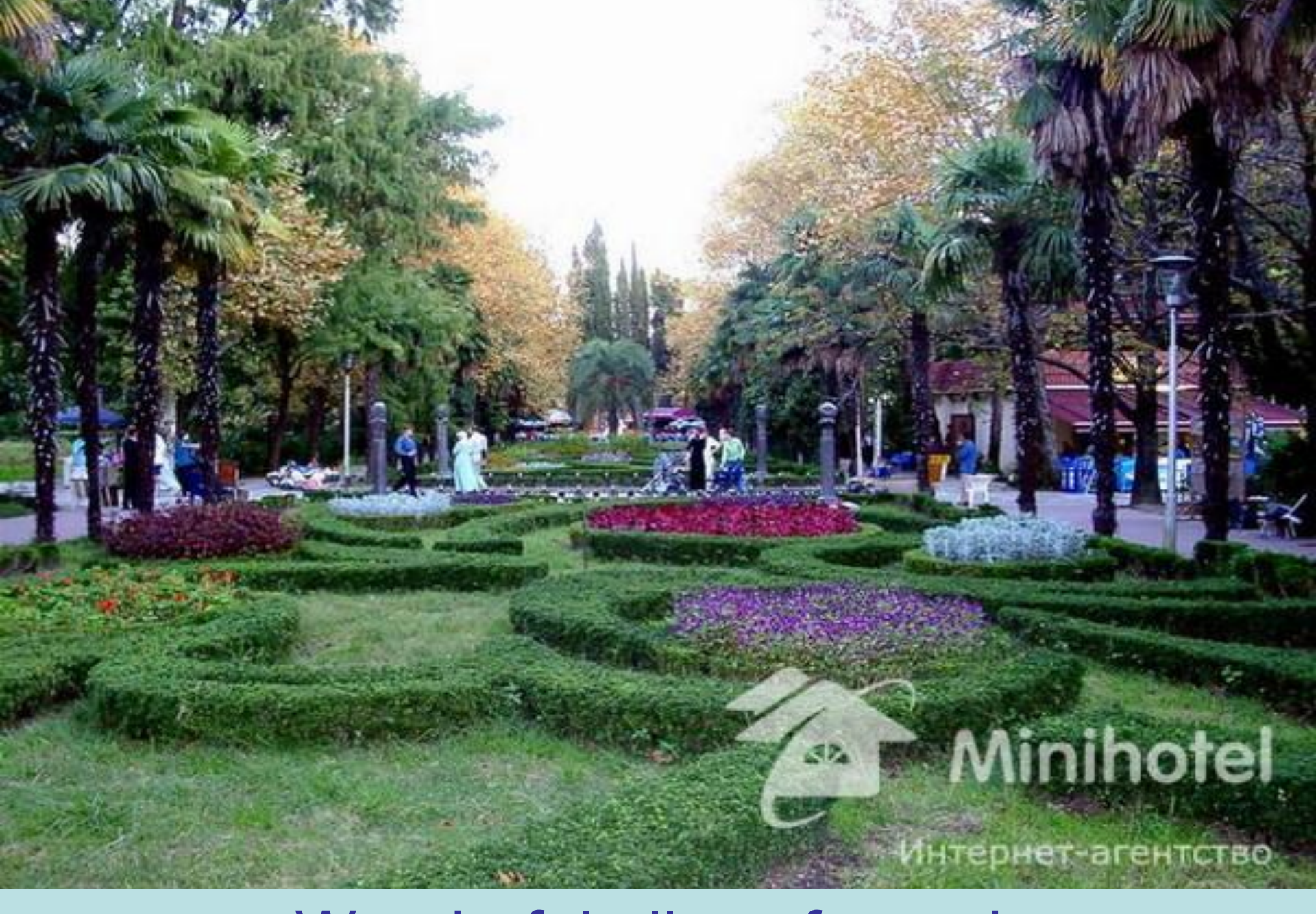
Wonderful alley of a park