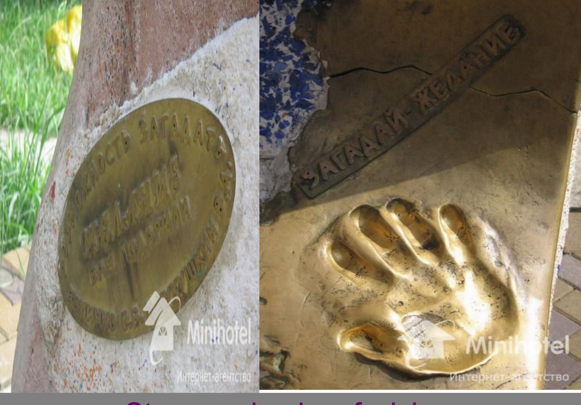
Stone and palm of wishes