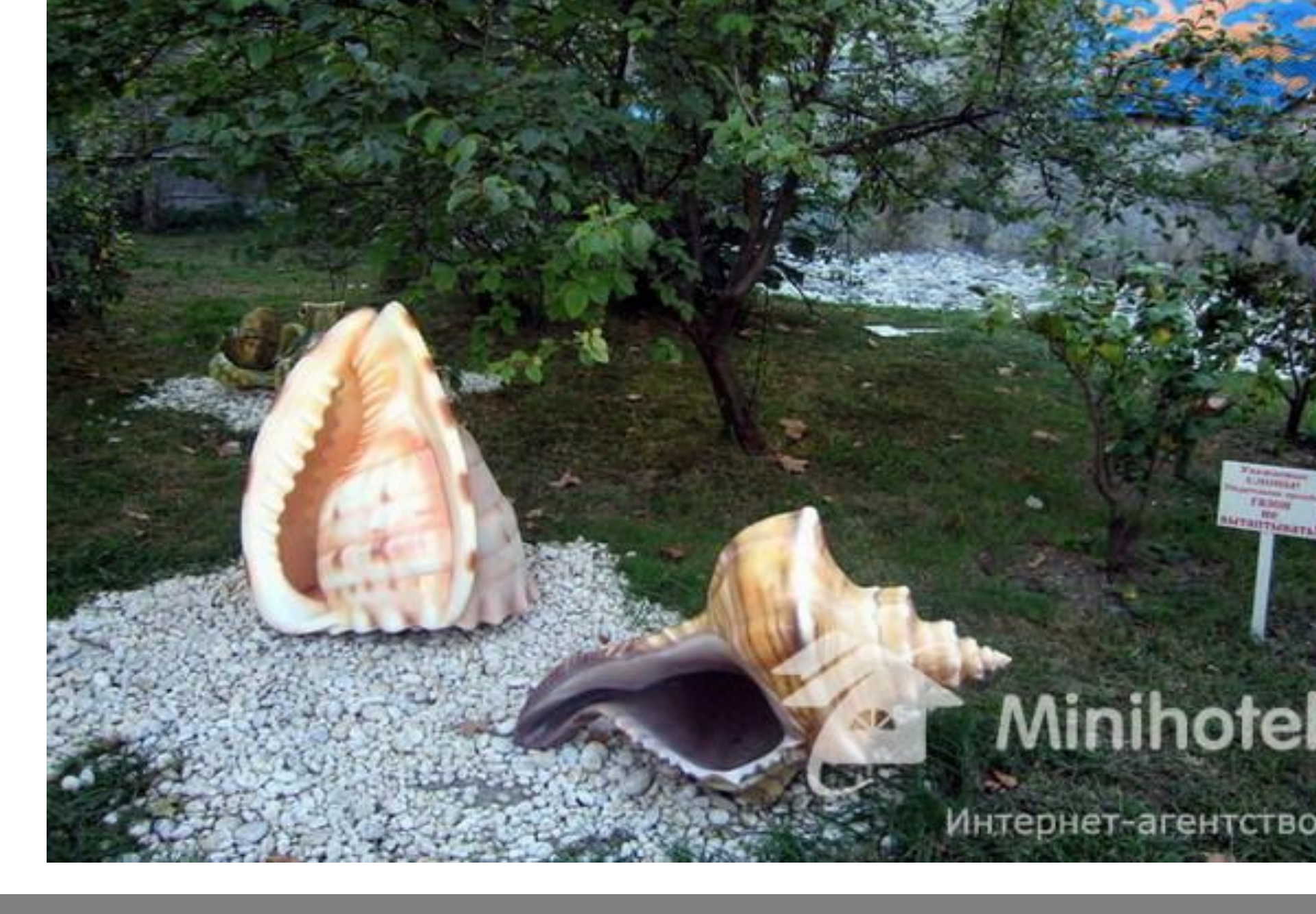
There are huge seashells