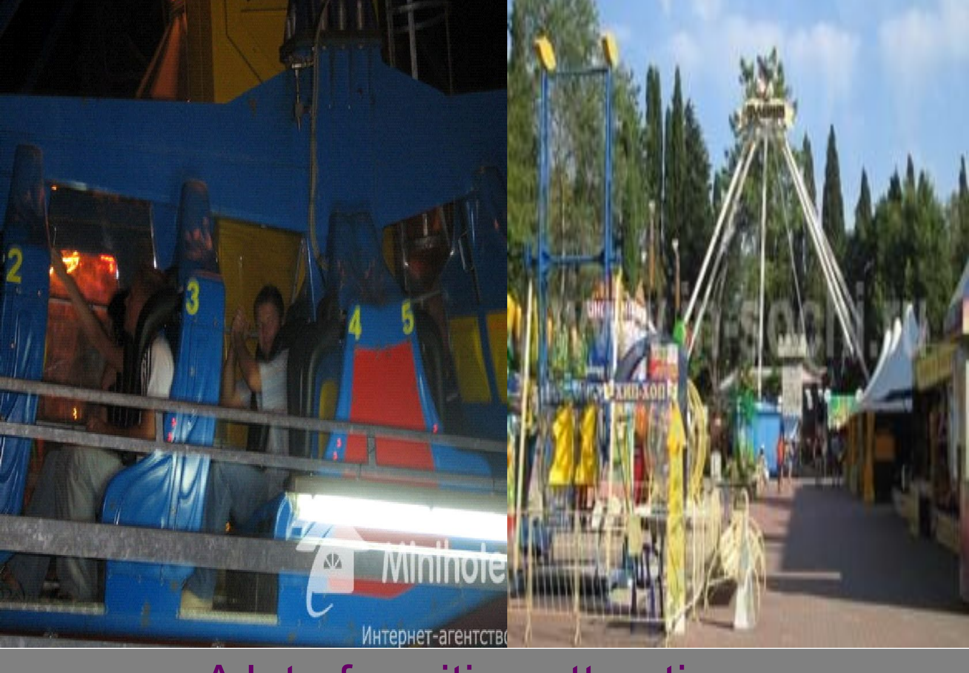
A lot of exciting attractions