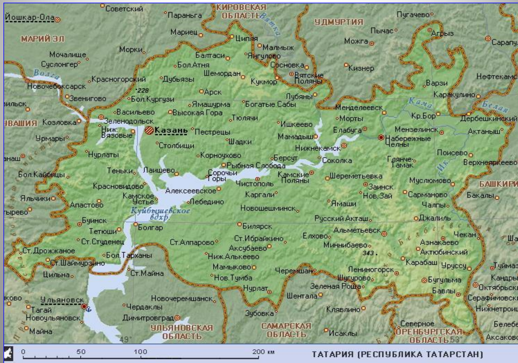
The map of Tatarstan