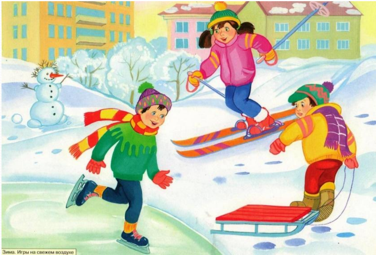
Зима. Игры на свежем воздухе