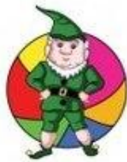
in front of