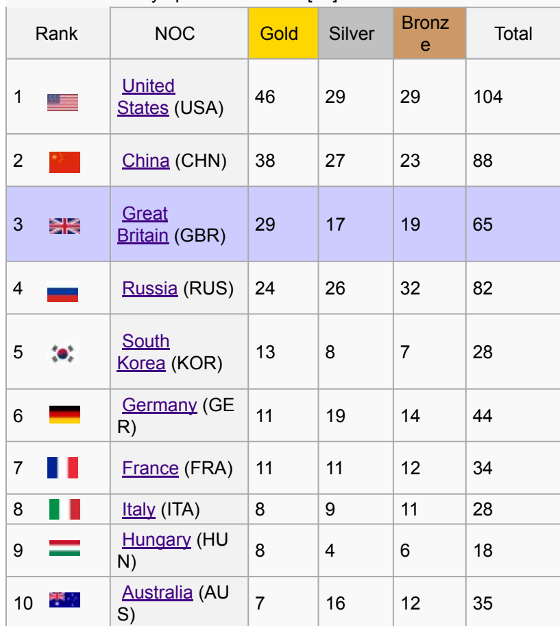
2012 Summer Olympics medal table[15]