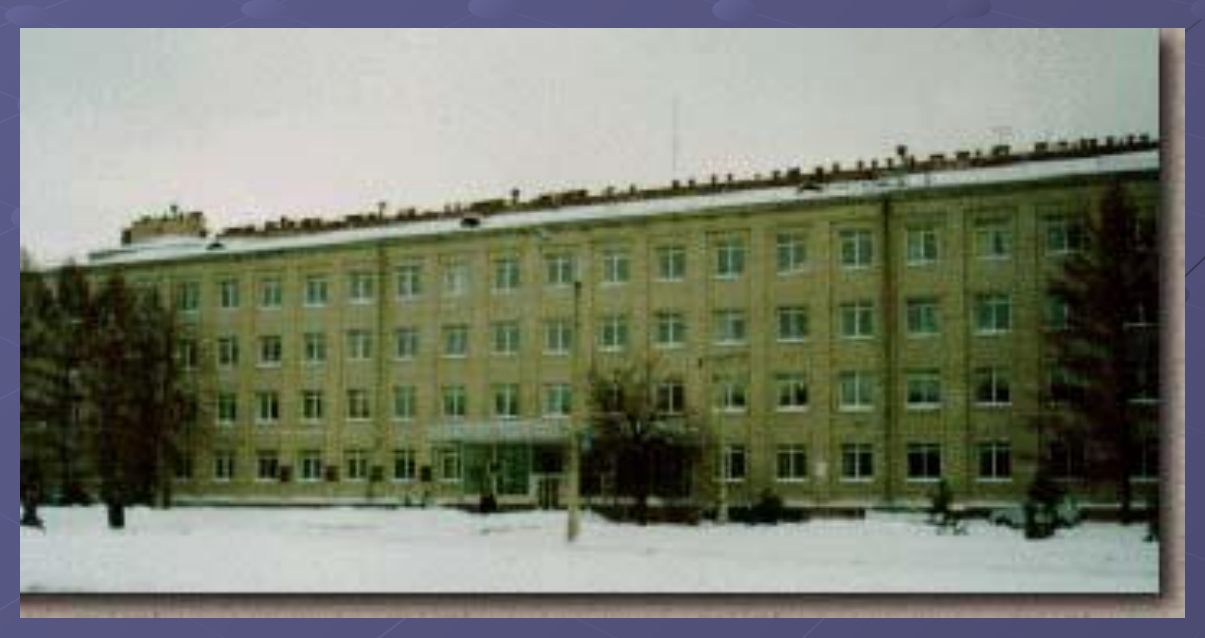
Institute of Geology

The Akademic centre is a prototype of a number of such centres of science in other countries. The Novosibirsk centre of science is the largest in the Siberian branch of SO RAN, there is about a half of its scientific potential there. The centre was built in 1957.