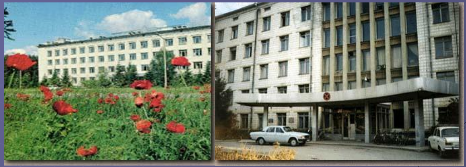
Institute of Mathematics