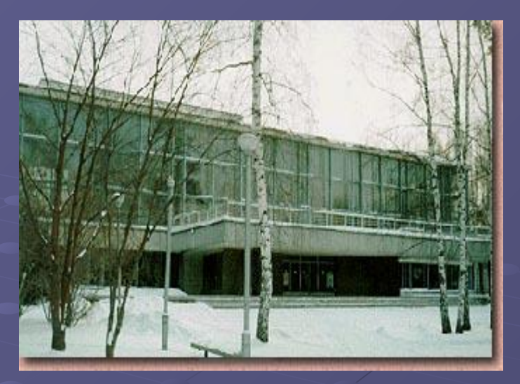
The house of the scientists

Science is one of the basic sources of the employment of the population in Novosibirsk Akademic centre.In Lavrentyev' avenue there are more than 40 research institutes.