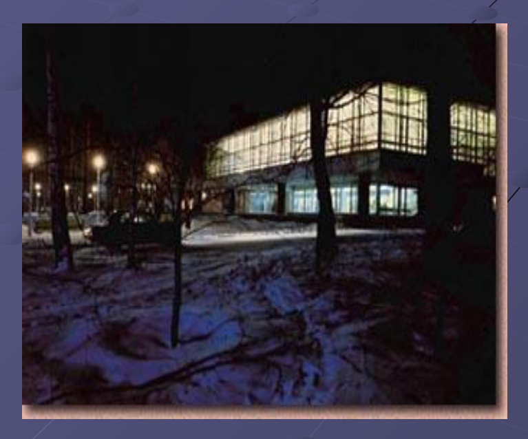
The house of the scientists in the night