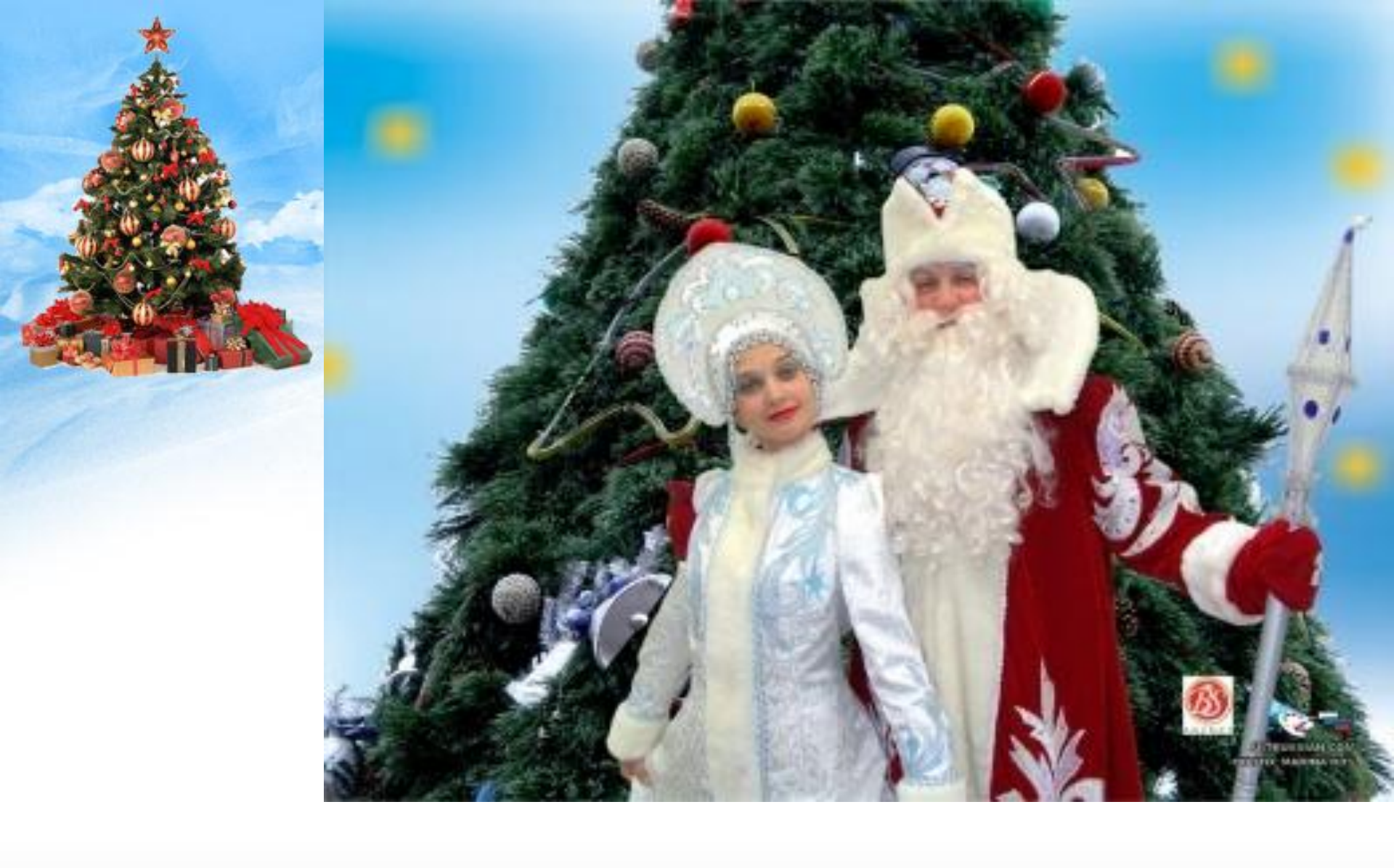
This holiday is considered to be a family holiday.