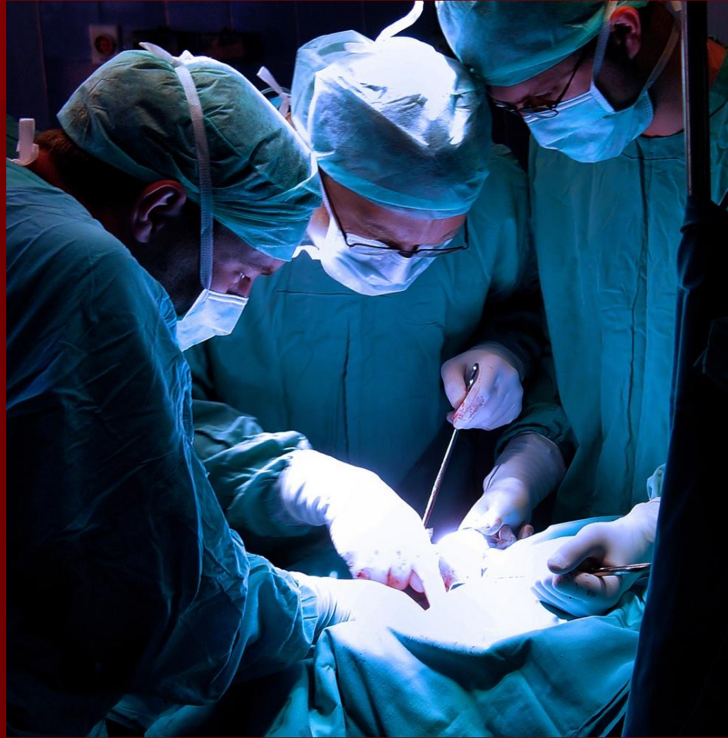
(surgery on the brain)

A neurosurgeon is a surgeon who specializes in operating on the brain, head, neck, and spinal cord.