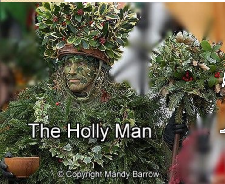
The Holly Man