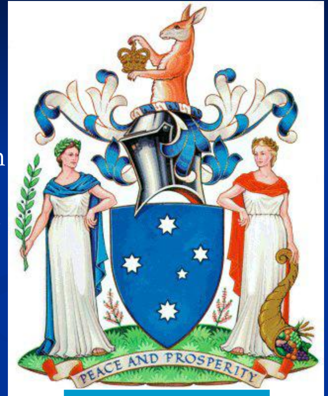
The State Victoria. Australia.

The shield is the focal point of the coat of arms, contained within is the badge of each Australian state. In the top half, from left to right, the states represented are: New South Wales, Victoria, and Queensland. In the bottom half, from left to right: South Australia, Western Australia, and Tasmania. Above the shield is the seven-pointed 'Commonwealth Star' or 'Star of Federation' above a blue and gold wreath, forming the crest. Six of the points on the star represent the original six states, while the seventh point represents the combined territories and any future states of Australia. In its entirety the shield represents the federation of Australia.