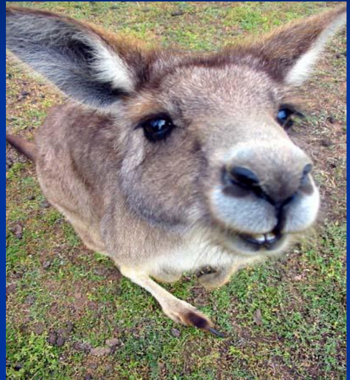
Ostrich and kangaroo