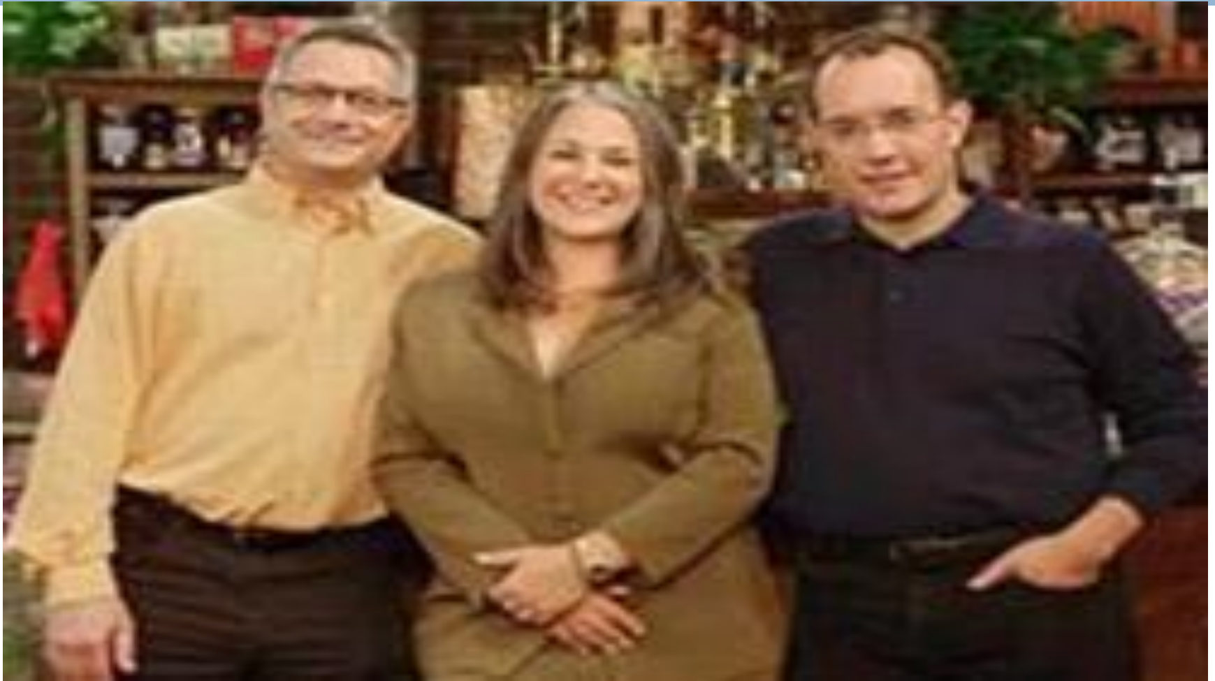
Kevin Bright, Marta Kauffman, Kevin Bright.