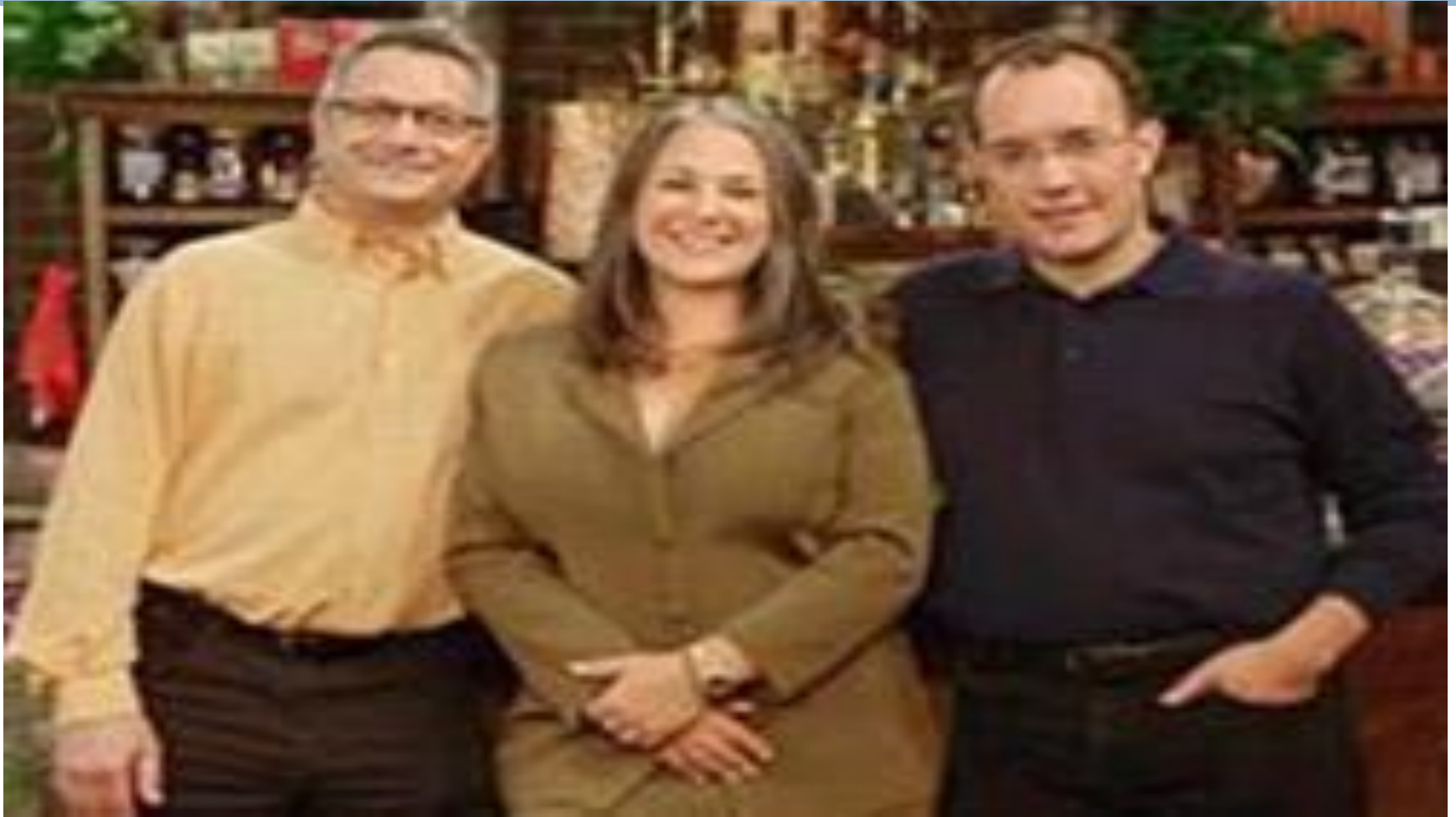
Kevin Bright, Marta Kauffman, Kevin Bright.