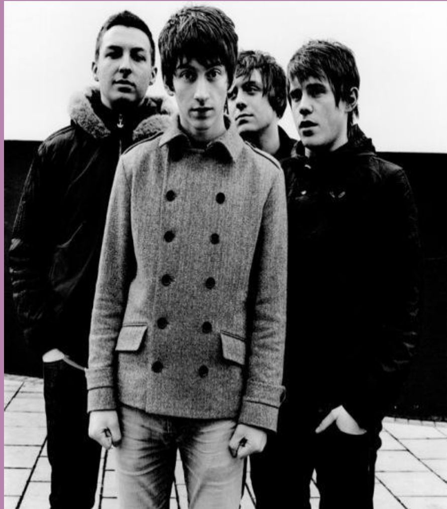
Famous indie-rock band “Arctic Monkeys”

Indie rock has been identified as a reaction against the "macho" culture that developed in alternative rock.