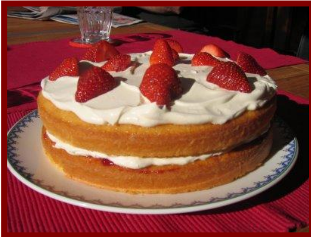
The Victoria Sponge Named after Queen Victoria

Although many foreigners find British food disgusting, British teenagers in the survey enjoy eating bacon sandwiches , baked beans , cheddar cheese and curry (well, it's not British but it is one of Britain's most popular foods). Also, we know it's a British stereotype but many British teenagers still like drinking a nice cup of tea in the morning.