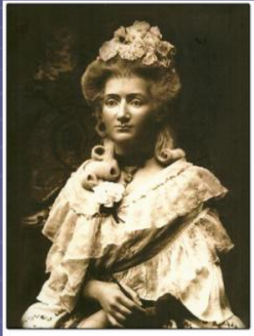
Madame Marie Tussaud: 1761 - 1850