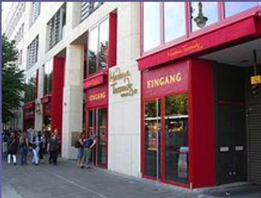
Entry of Madame Tussauds in Berlin