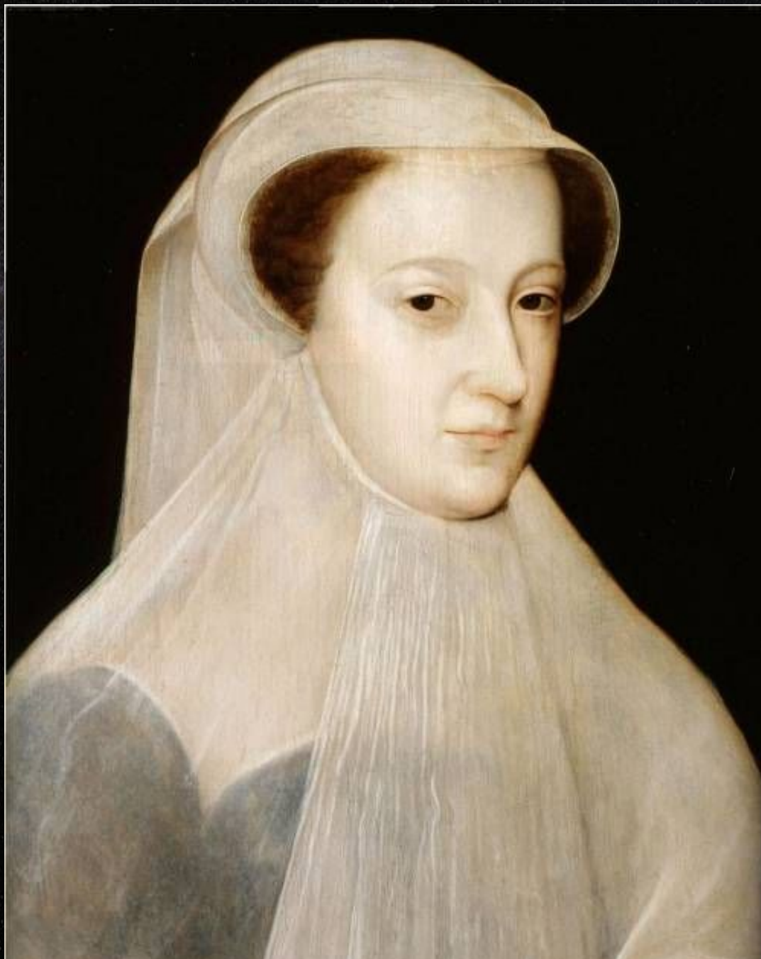
Portrait of Mary Stuart