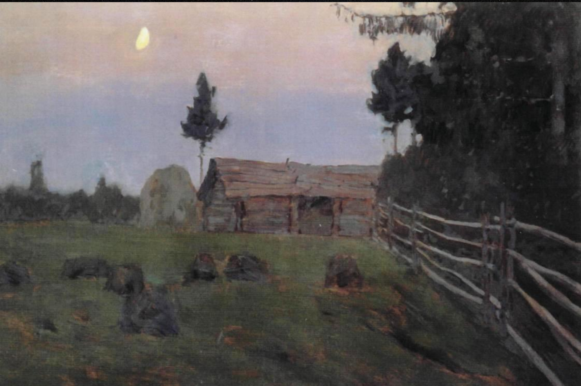
«Twilight» Isaac Levitan