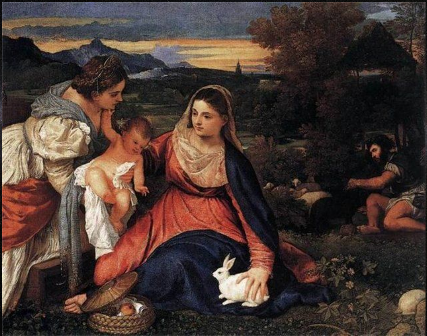
"Madonna with Child and Catherine of Alexandria"