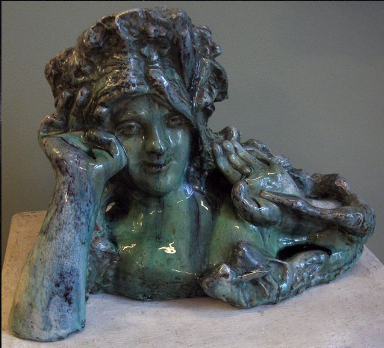
"Sea Queen Volkhov" - Mikhail Vrubel