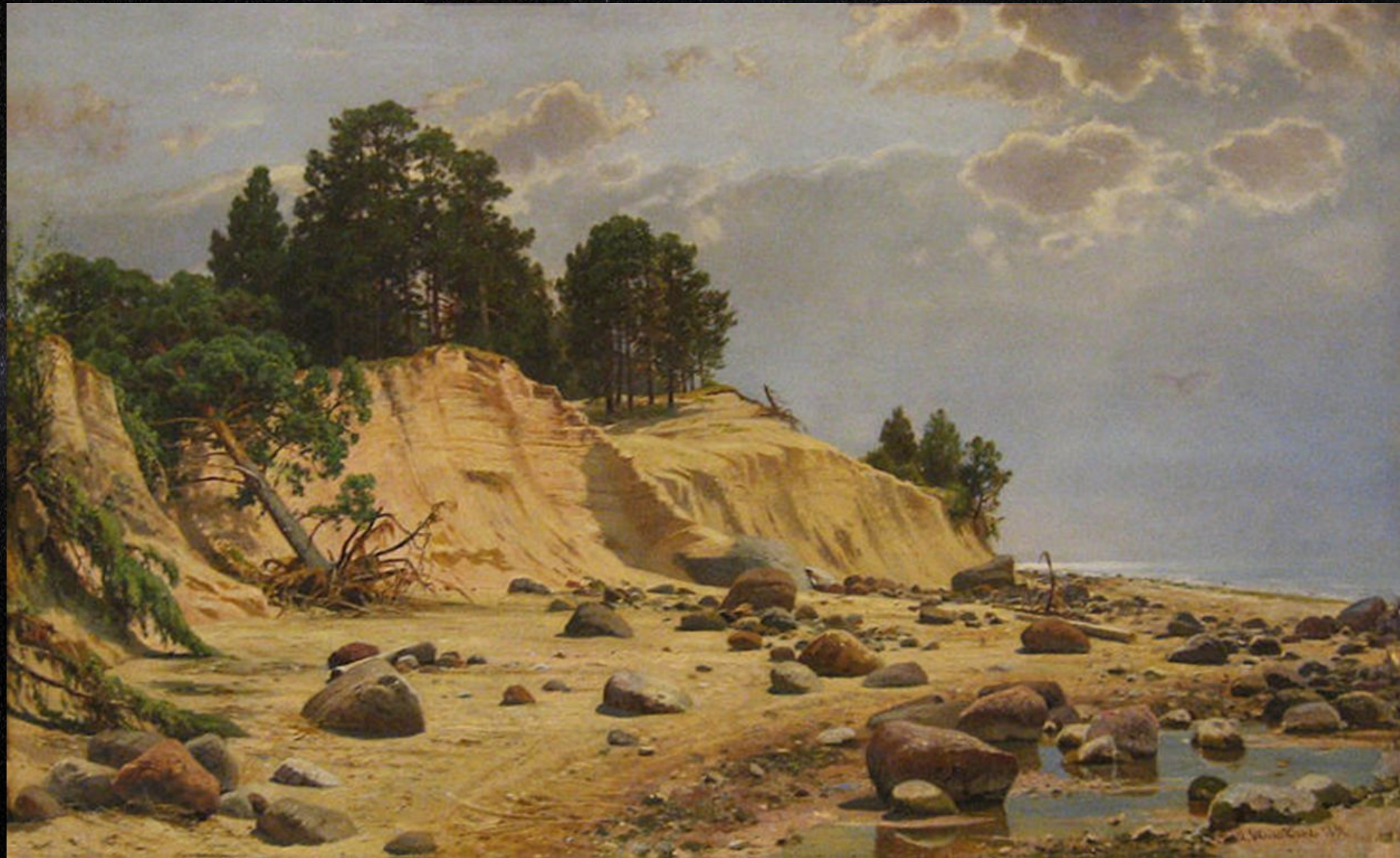
Landscape "After the storm in Mary-Hovi" Shishkin