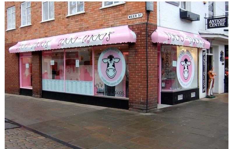
Moo-Moo's Milk Shake Shop 4