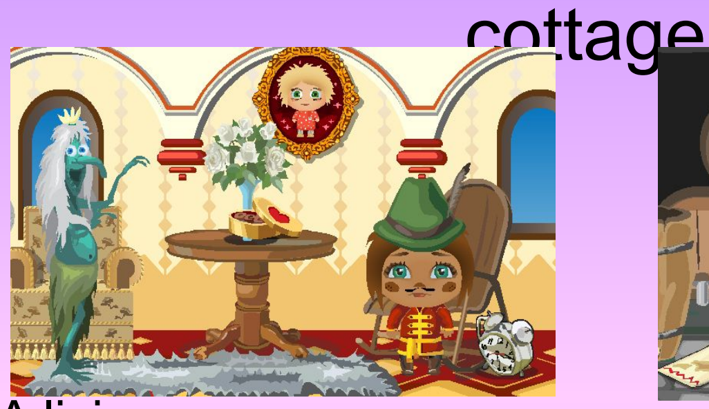
A living room