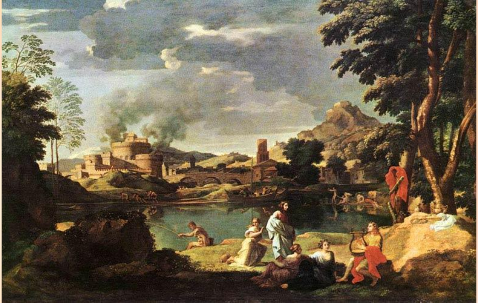
"Landscape with Orpheus and Eurydice"