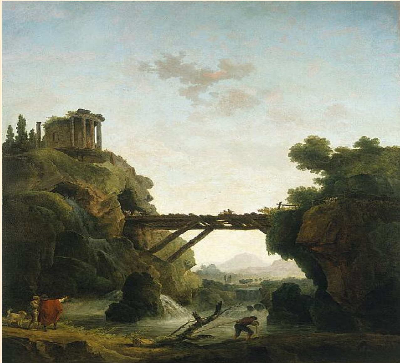
"Fantastic View of Tivoli"