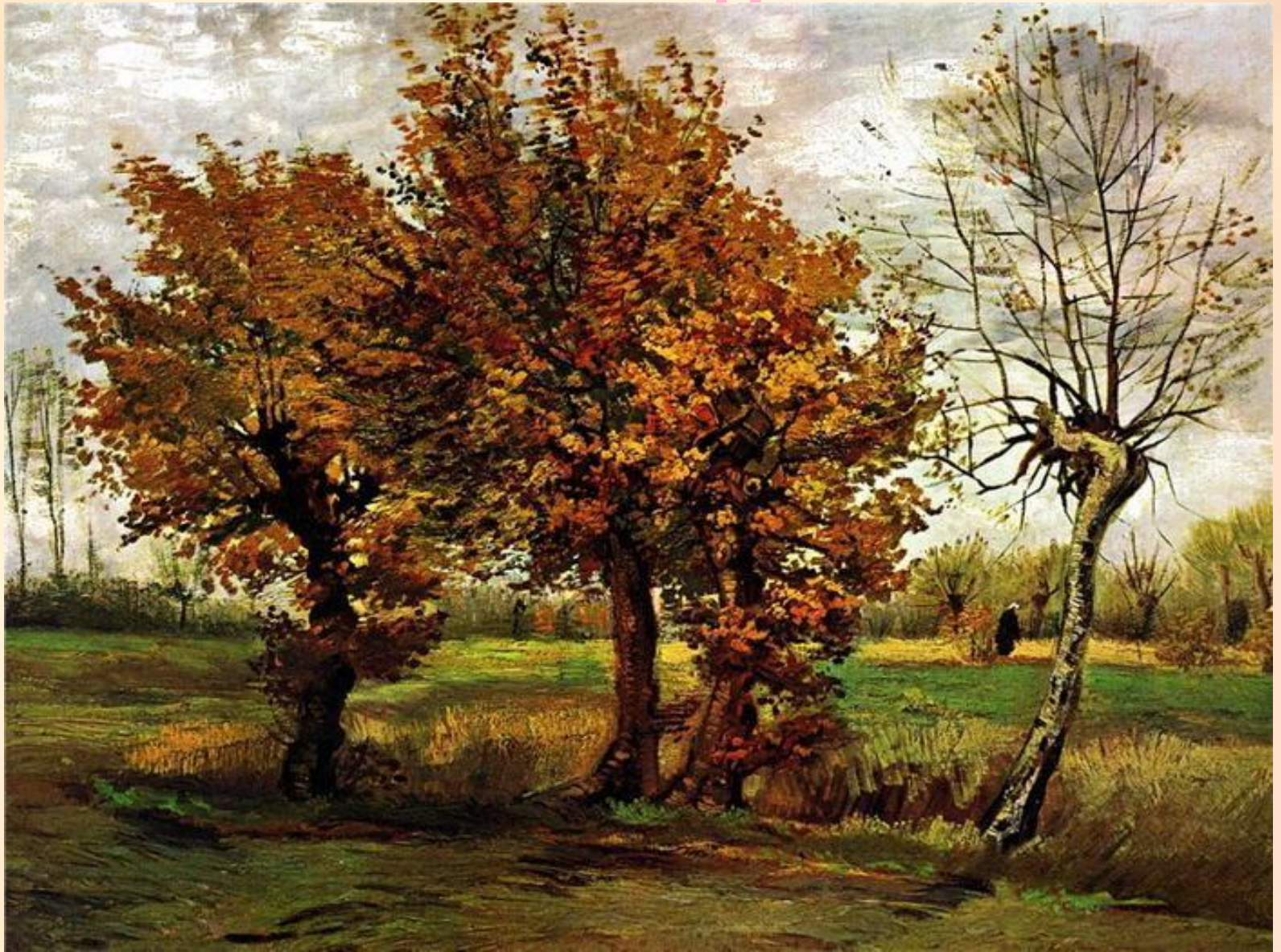
“Autumn Landscape with Four Trees “