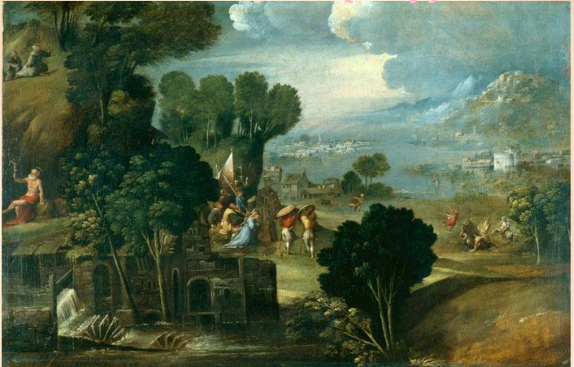
“Landscape with scenes from the life of the Holy”