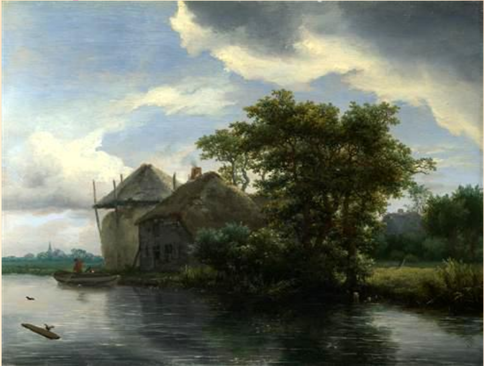
"A Bleaching Ground in a Hollow by a Cottage"