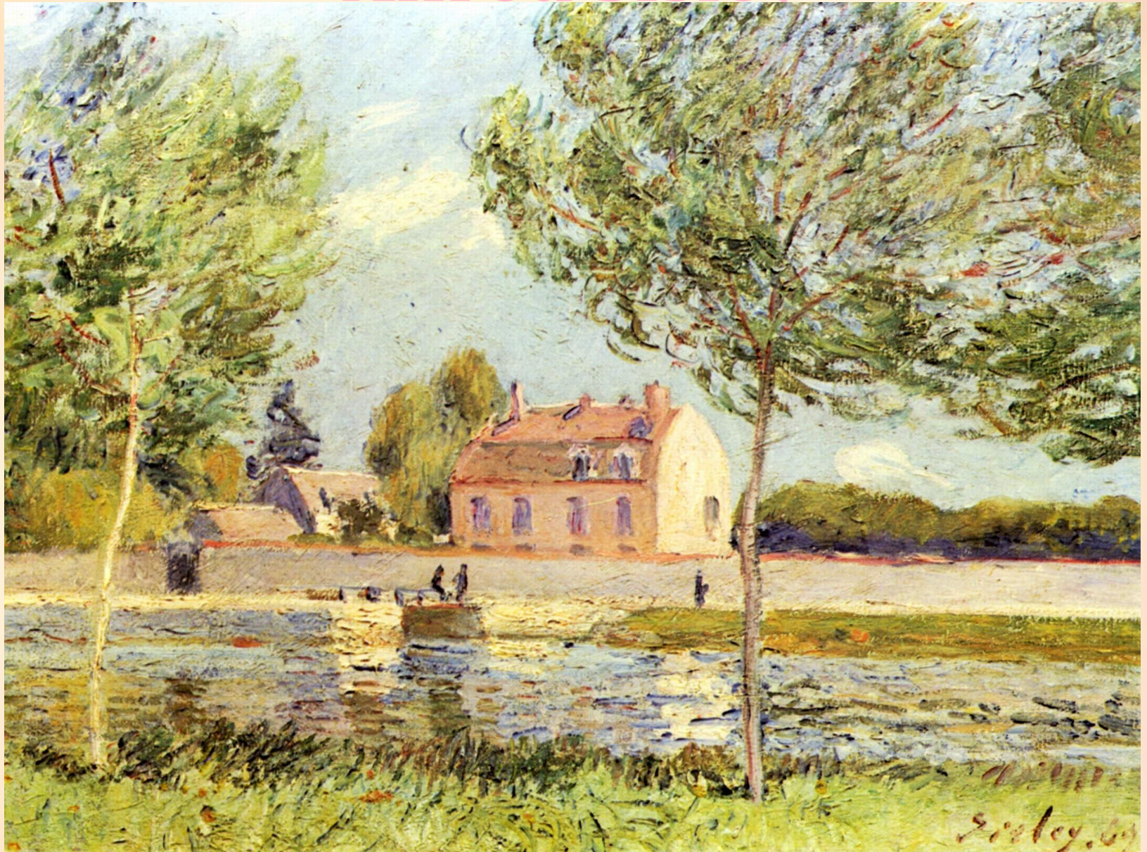
“Houses on the banks of the Loing”