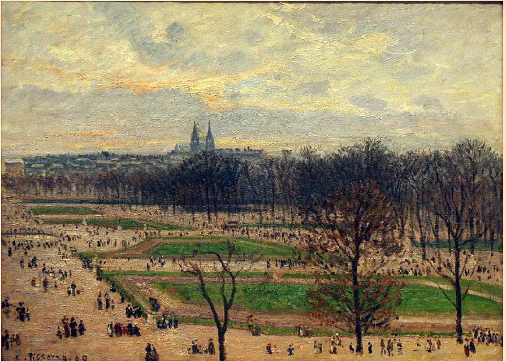
“The Garden of the Tuileries on a Winter Afternoon”