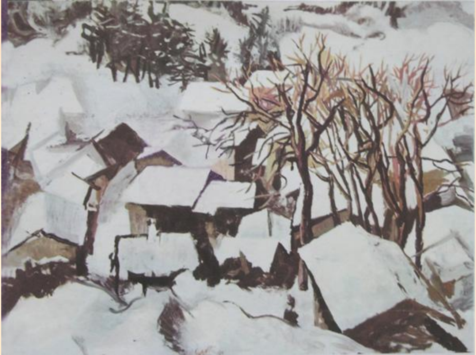
"Winter Landscape in Lombardy"