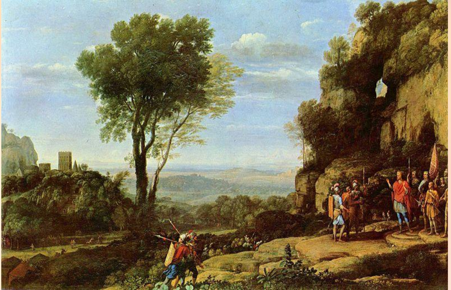
“Landscape with David at the Cave of Adullam”