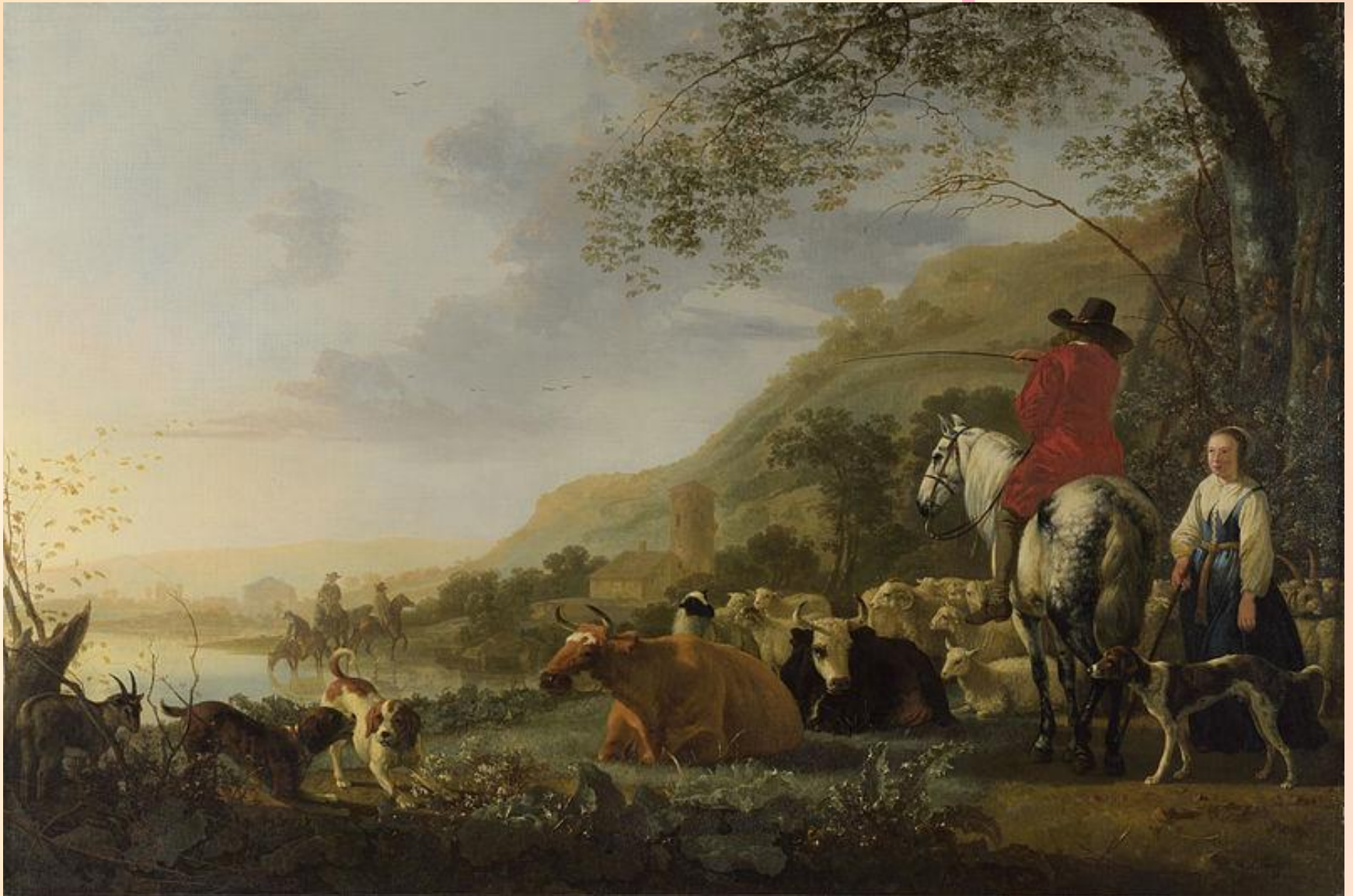
“A Hilly Landscape with Figure”