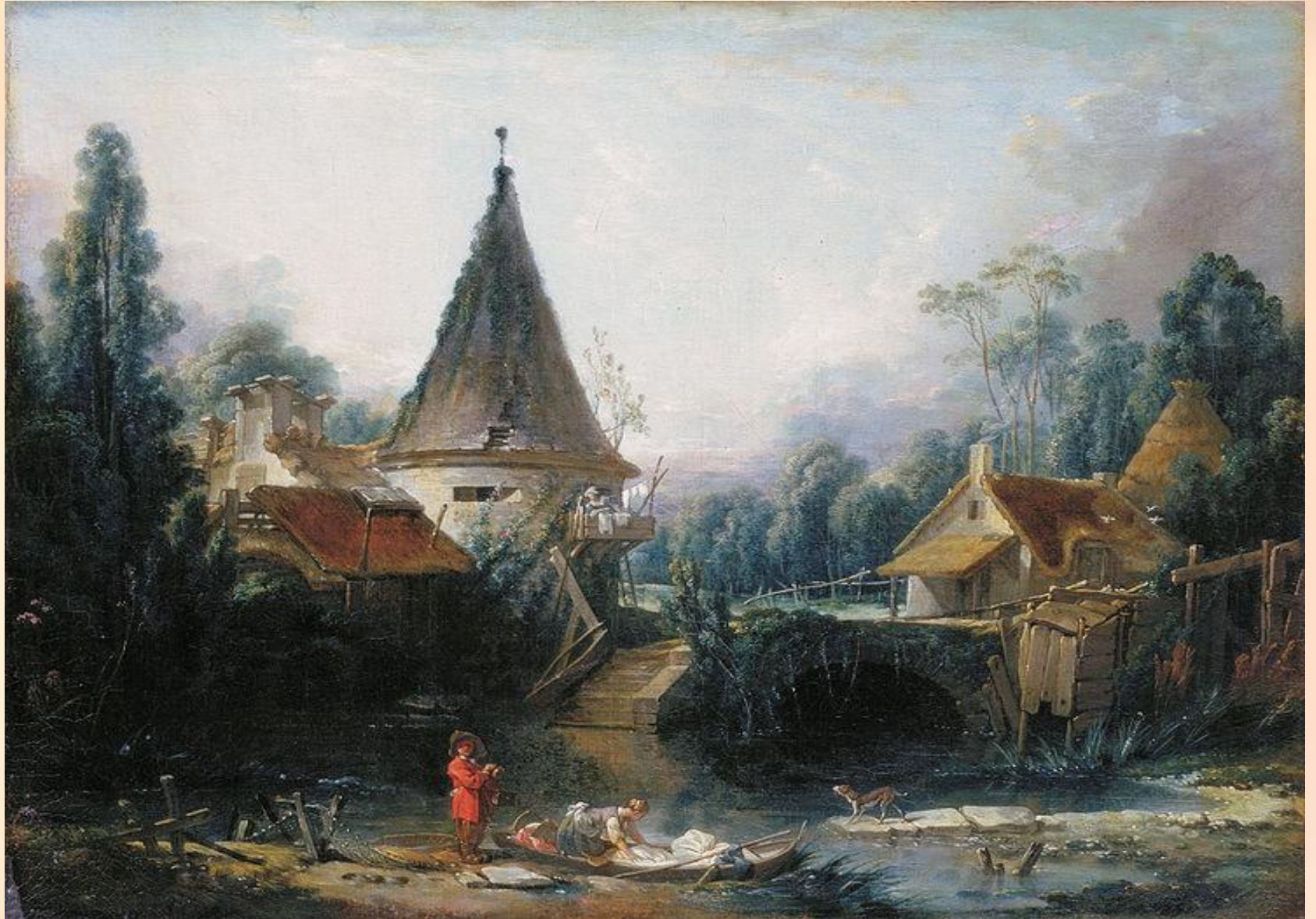
"Landscape near Beauvais"