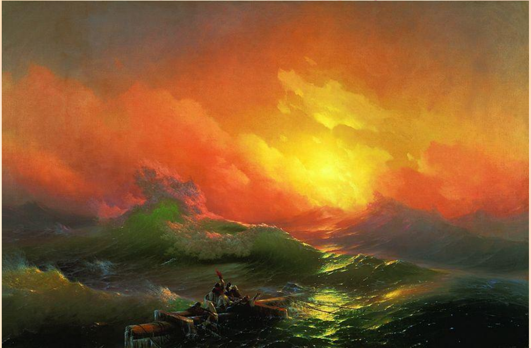
"The Ninth Wave"