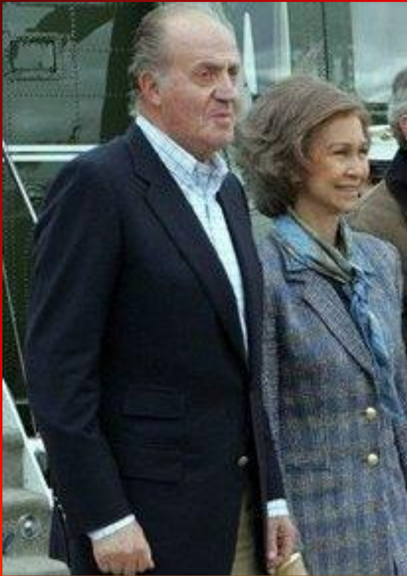
HM Juan Carlos I King of Spain and HM Queen Sofía of Spain.