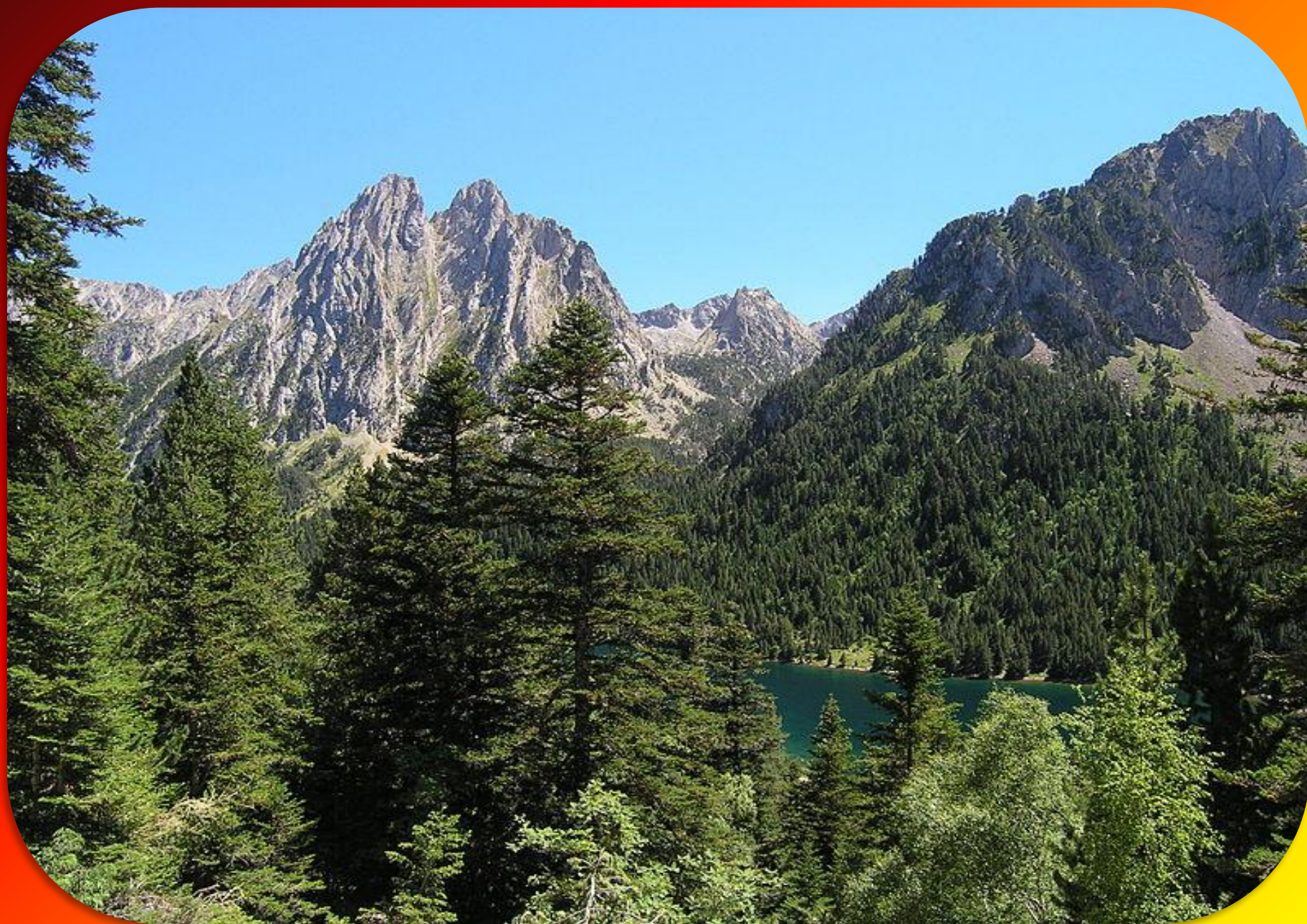
Sant Maurici National Park in the Pyrenees.