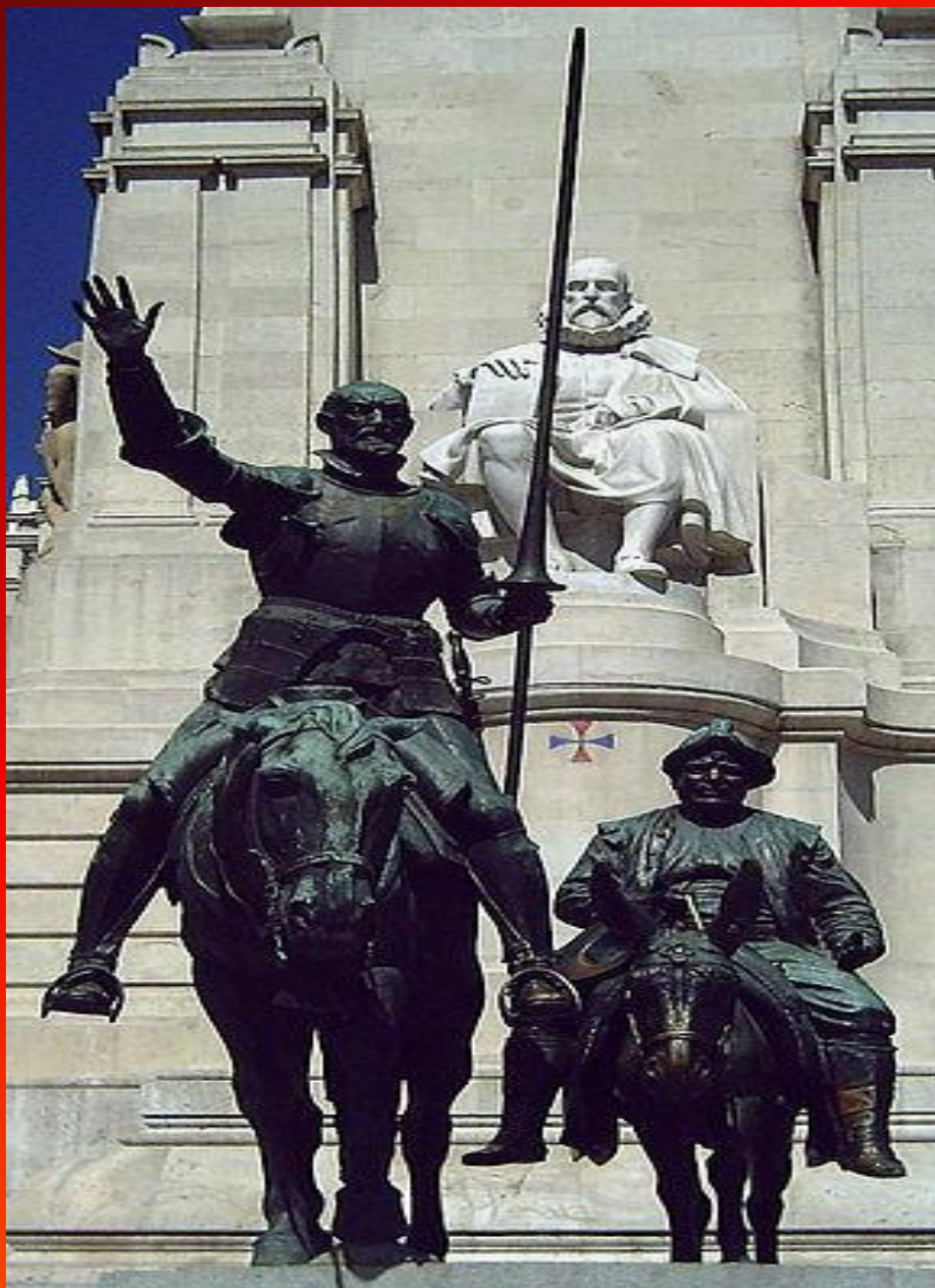
Bronze statues of Don Quixote and Sancho Panza, at the Plaza de España in Madrid