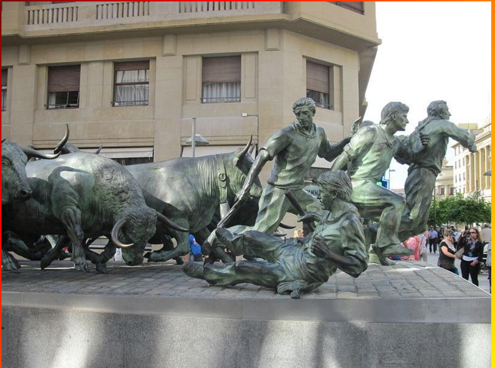
Monument in Pamplona