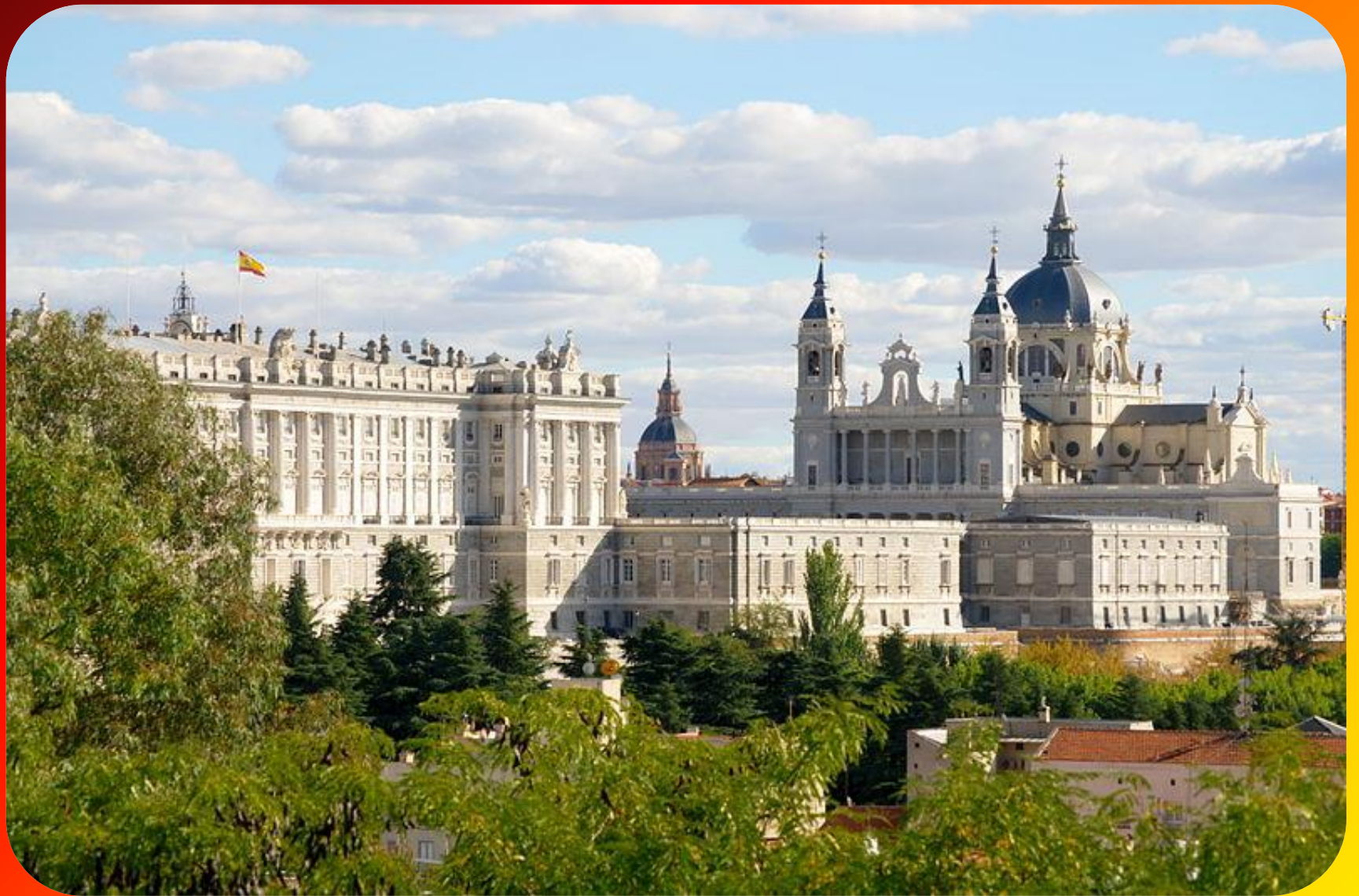
Royal Palace and Santa María la Real de La Almudena