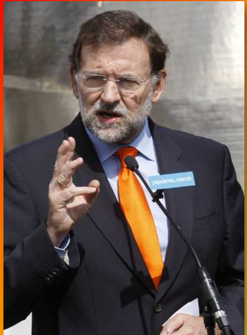
Mariano Rajoy, Prime minister