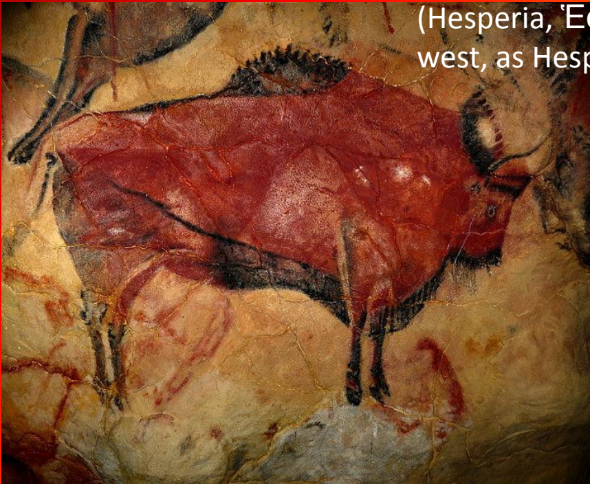
Altamira Cave paintings, in Cantabria

The origins of the Roman name Hispania, from which the modern name España was derived, are uncertain and are possibly unknown due to the inadequate evidence. Hispania may derive from the poetic use of the term Hesperia, reflecting the Greek perception of Italy as a "western land" or "land of the setting sun" (Hesperia, Ἑσπερία in Greek) and Spain, being still further west, as Hesperia ultima