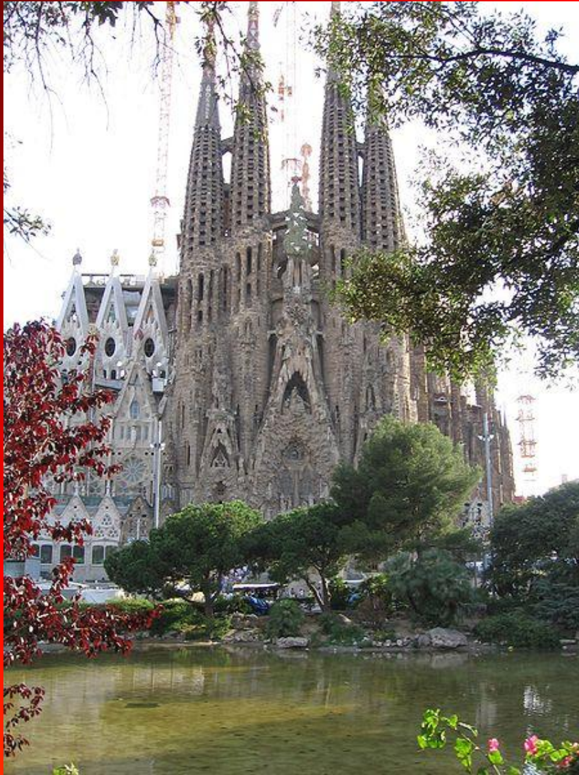
Sagrada Família of Antoni Gaudí, Barcelona.