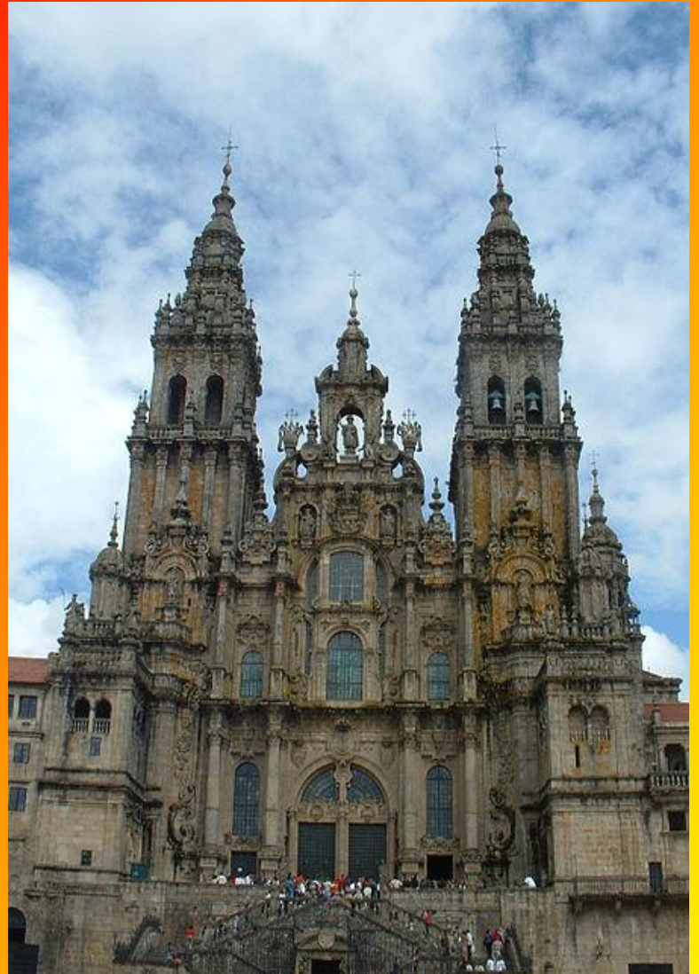
Santiago de Compostela Cathedral, A Coruña; terminus of the Way of St. James