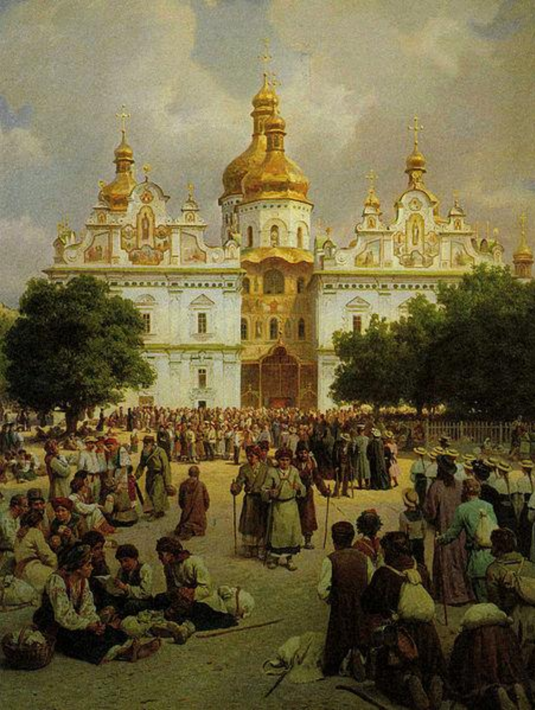
«The Great Church of the Kiev-Pechersk Lavra» painted by V. Vereshagin