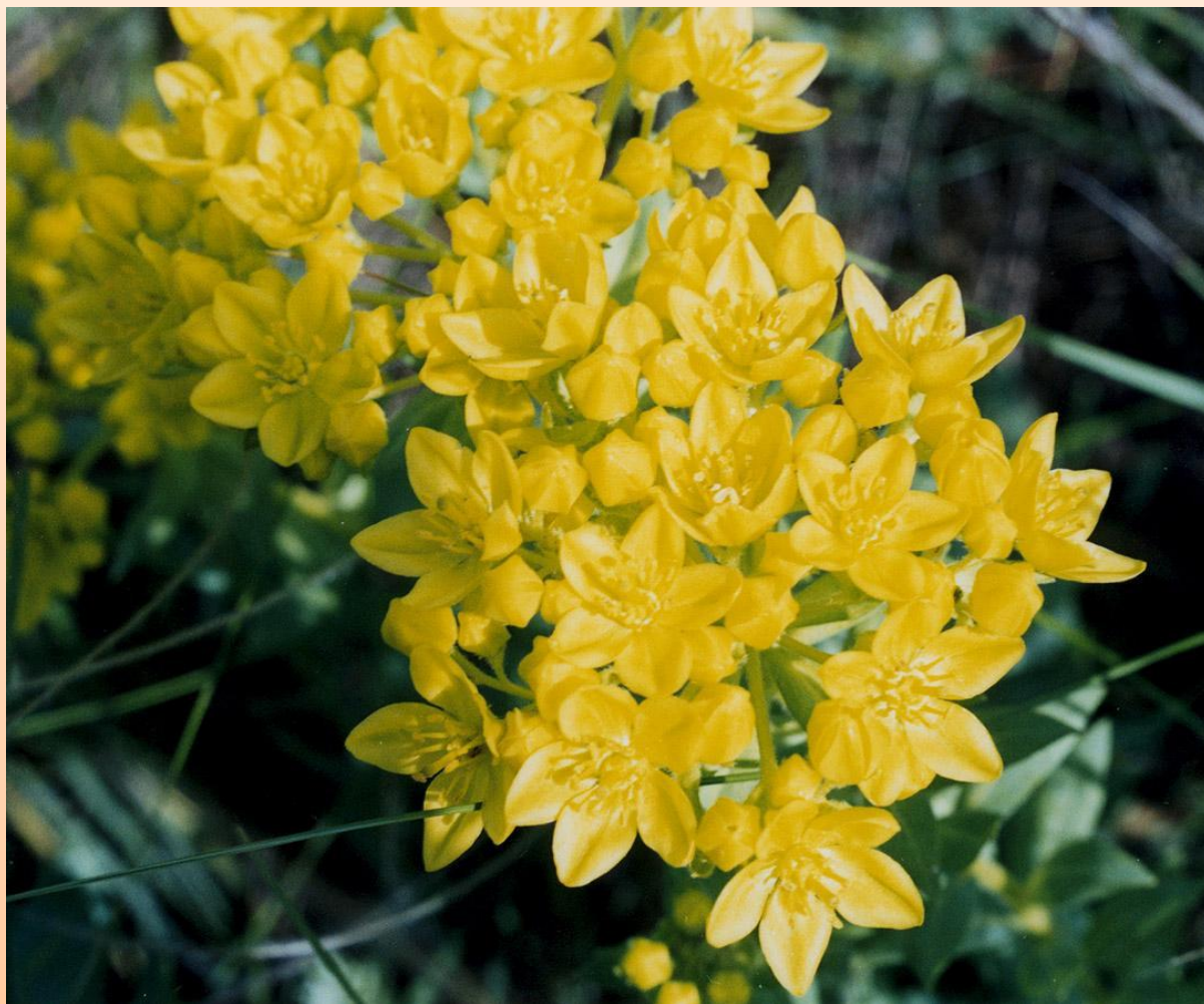
Harlophyllum suaveolens (Цельнолистник душистый)