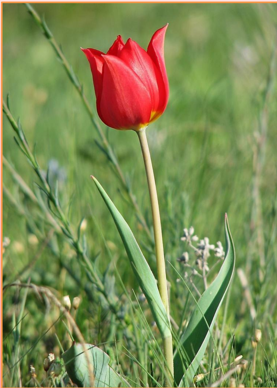
ра gesneriana льпан Геснера)