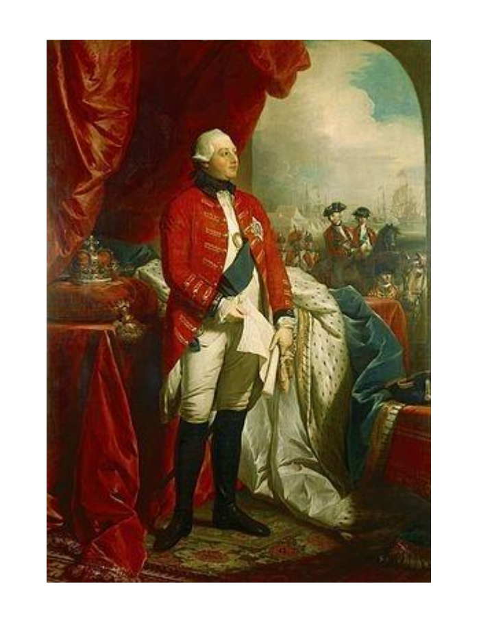
The gardens were created in 1722 under the patronage of George III, but Sir Joseph Banks encourage the project.