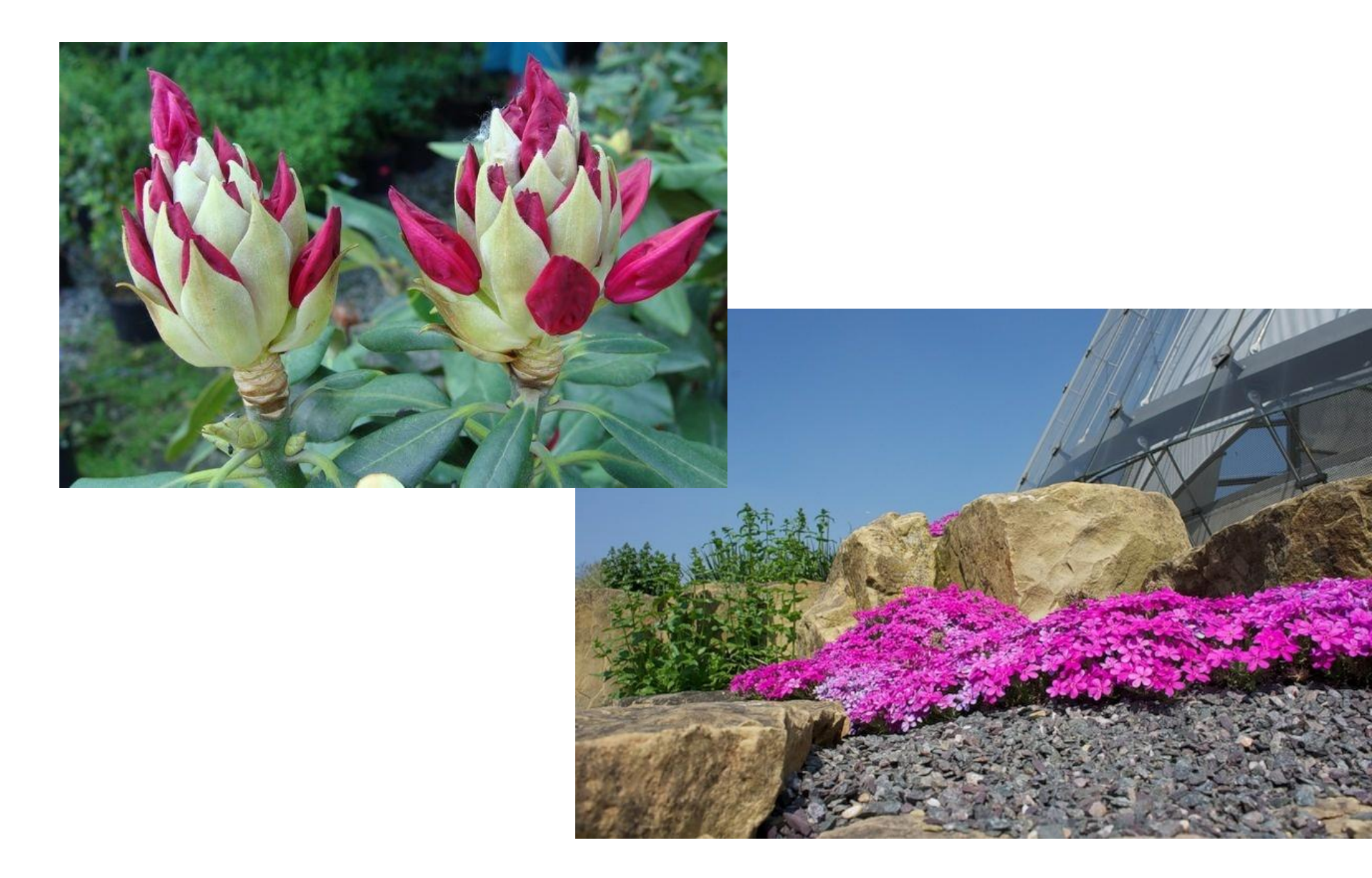
Go in the spring for the lilac and rhododendrons.