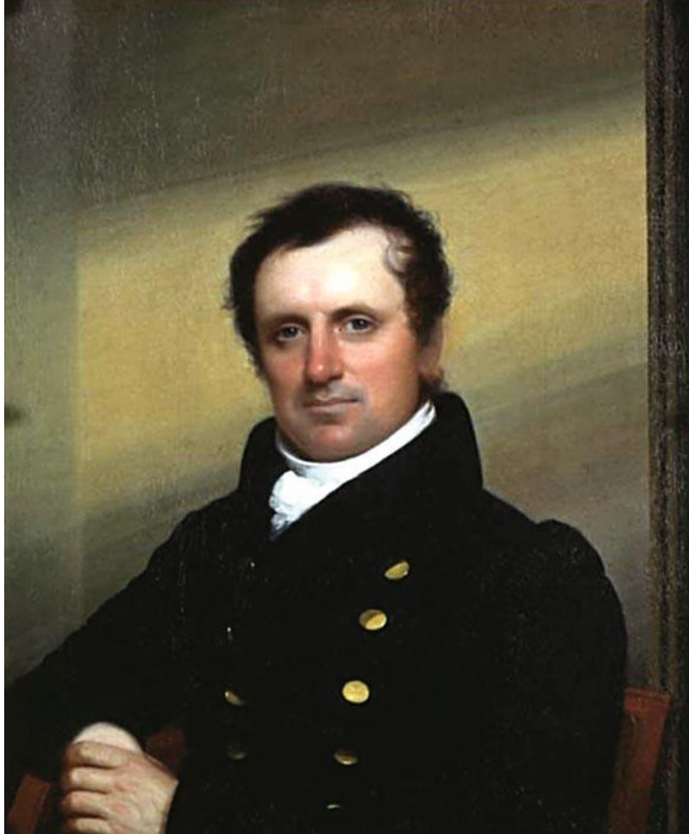
James Fenimore Cooper