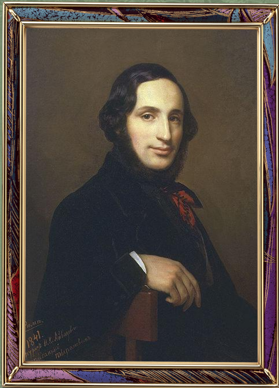
Portrait I. Ayvazovsky (1841)