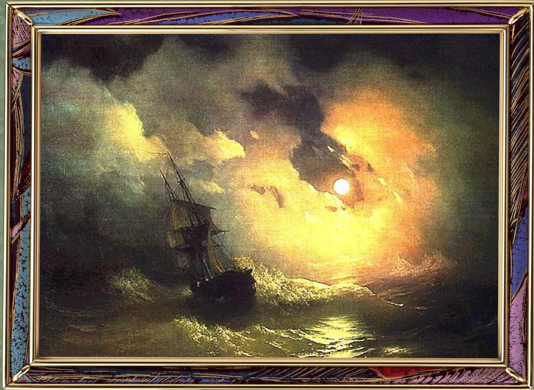
Storm in the Night(Шторм в ночи)