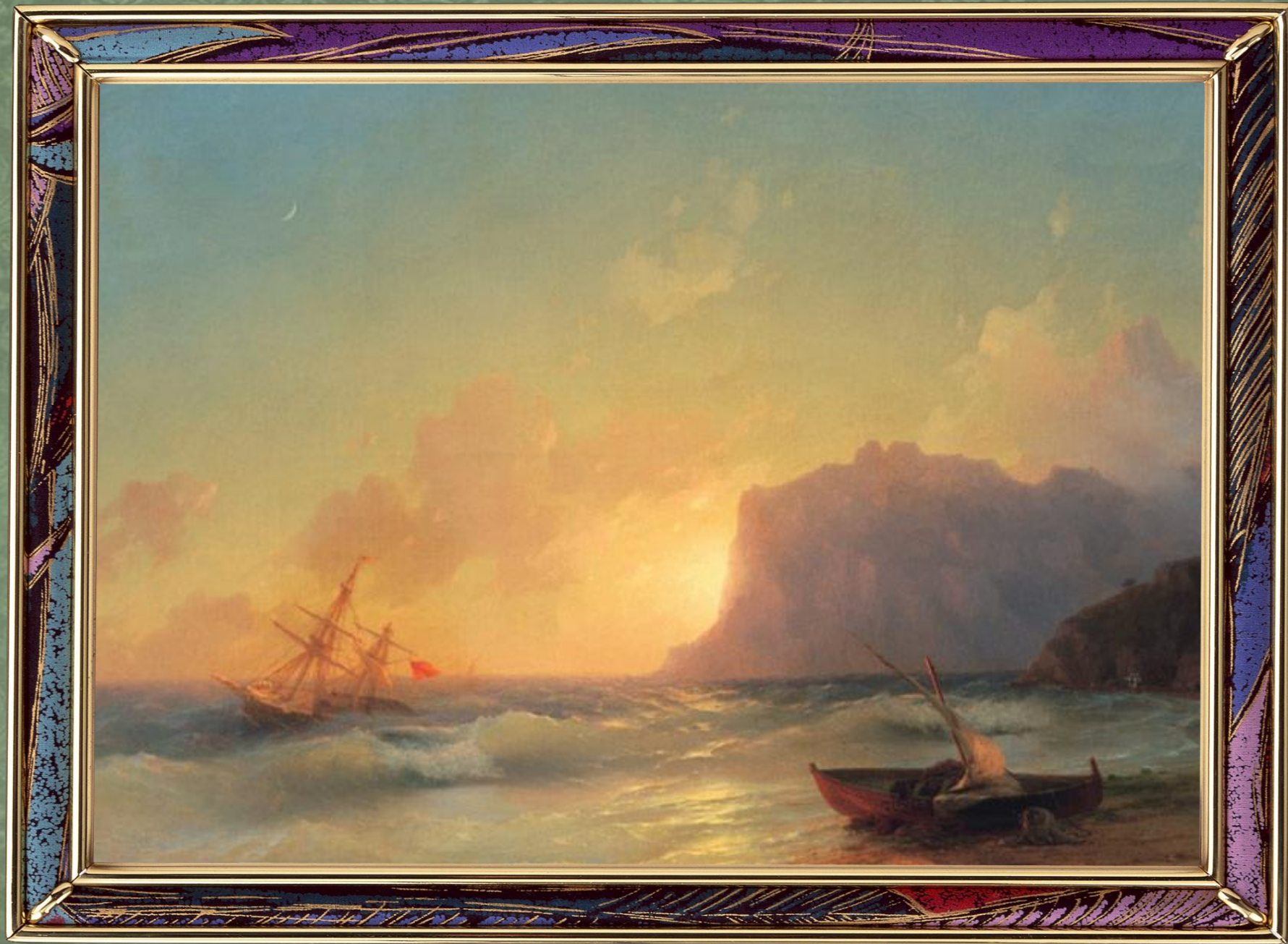
Sea. Koktebel (Море. Коктебель)