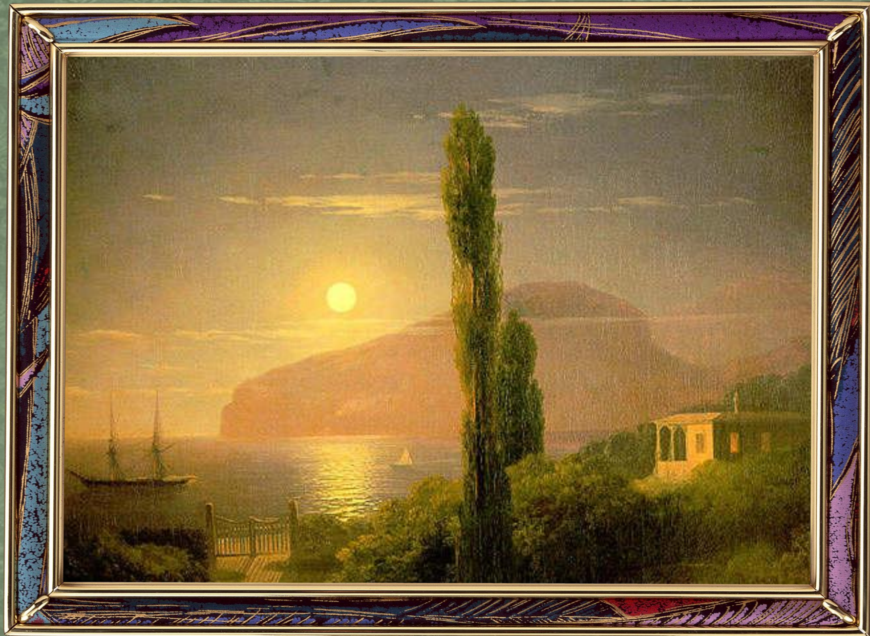
Moonlit night in the Crimea (Лунная ночь в Крыму)