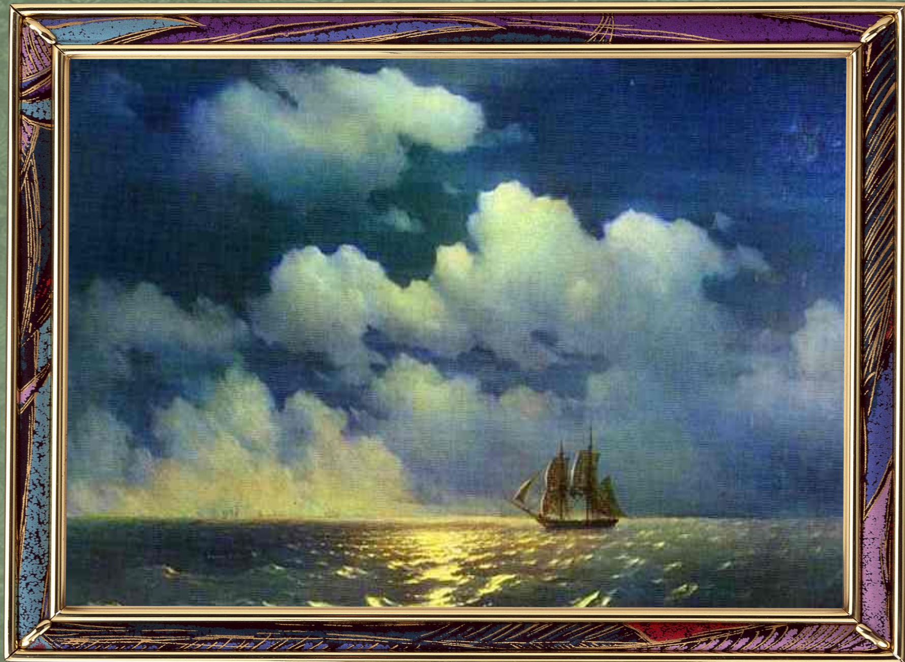
Meeting Brig Mercury with the Russian squadron