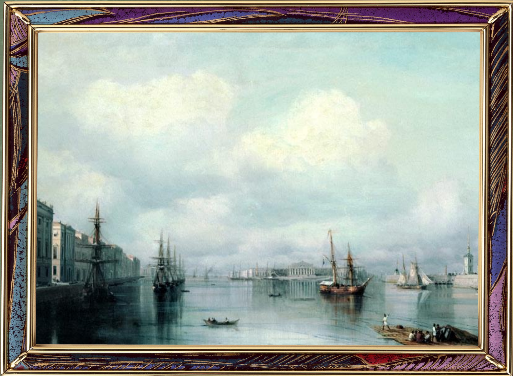
View of St. Petersburg (Вид Петербурга)