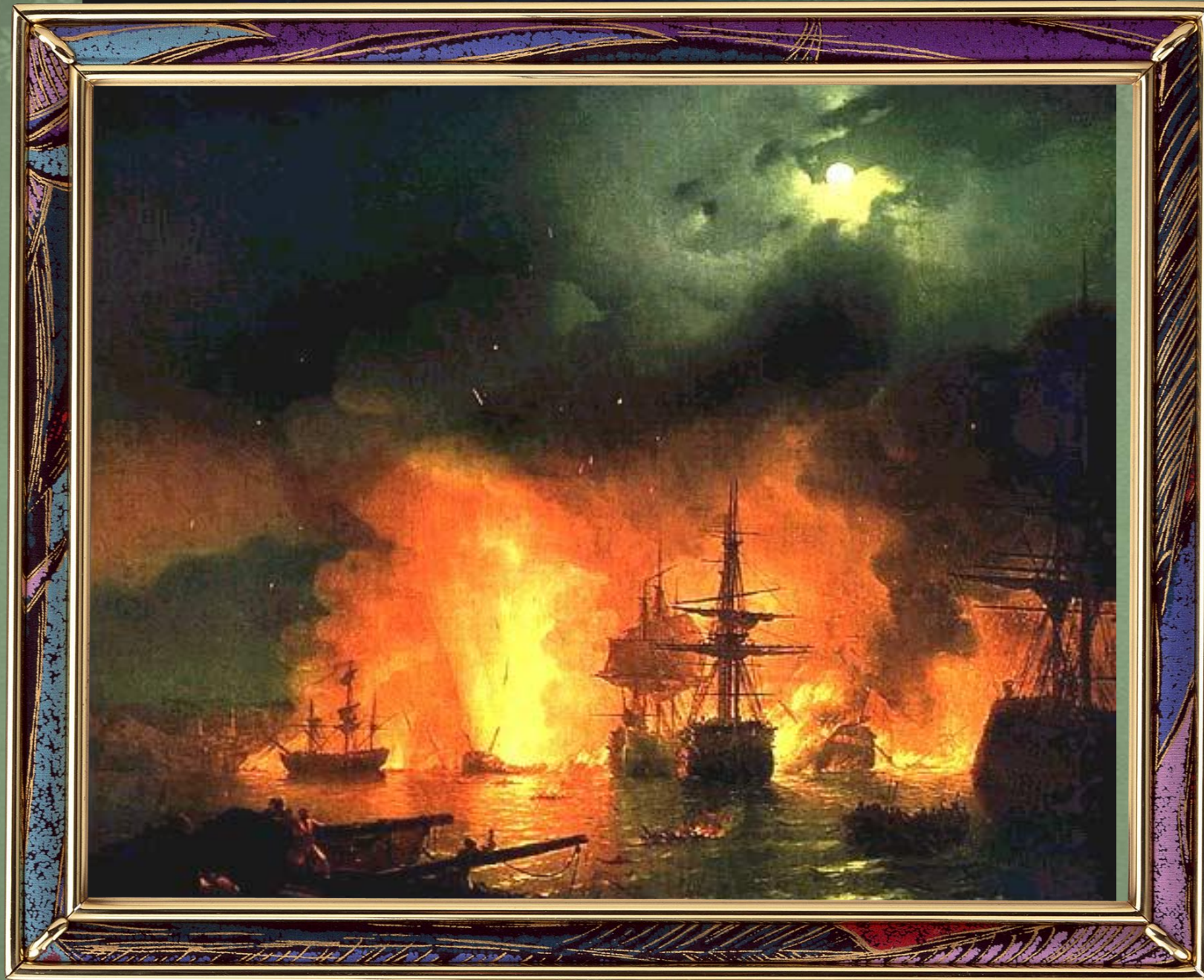
The Battle(Чесменский бой)