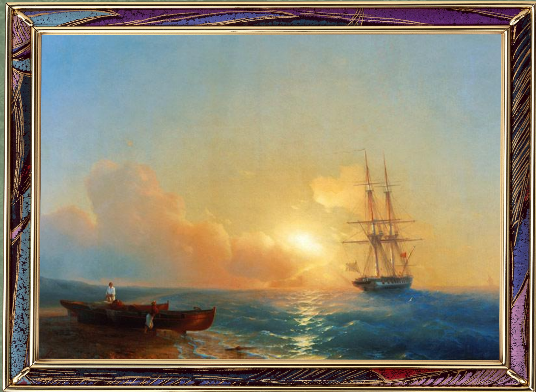
Fishermen on the beach(Рыбаки на берегу моря)