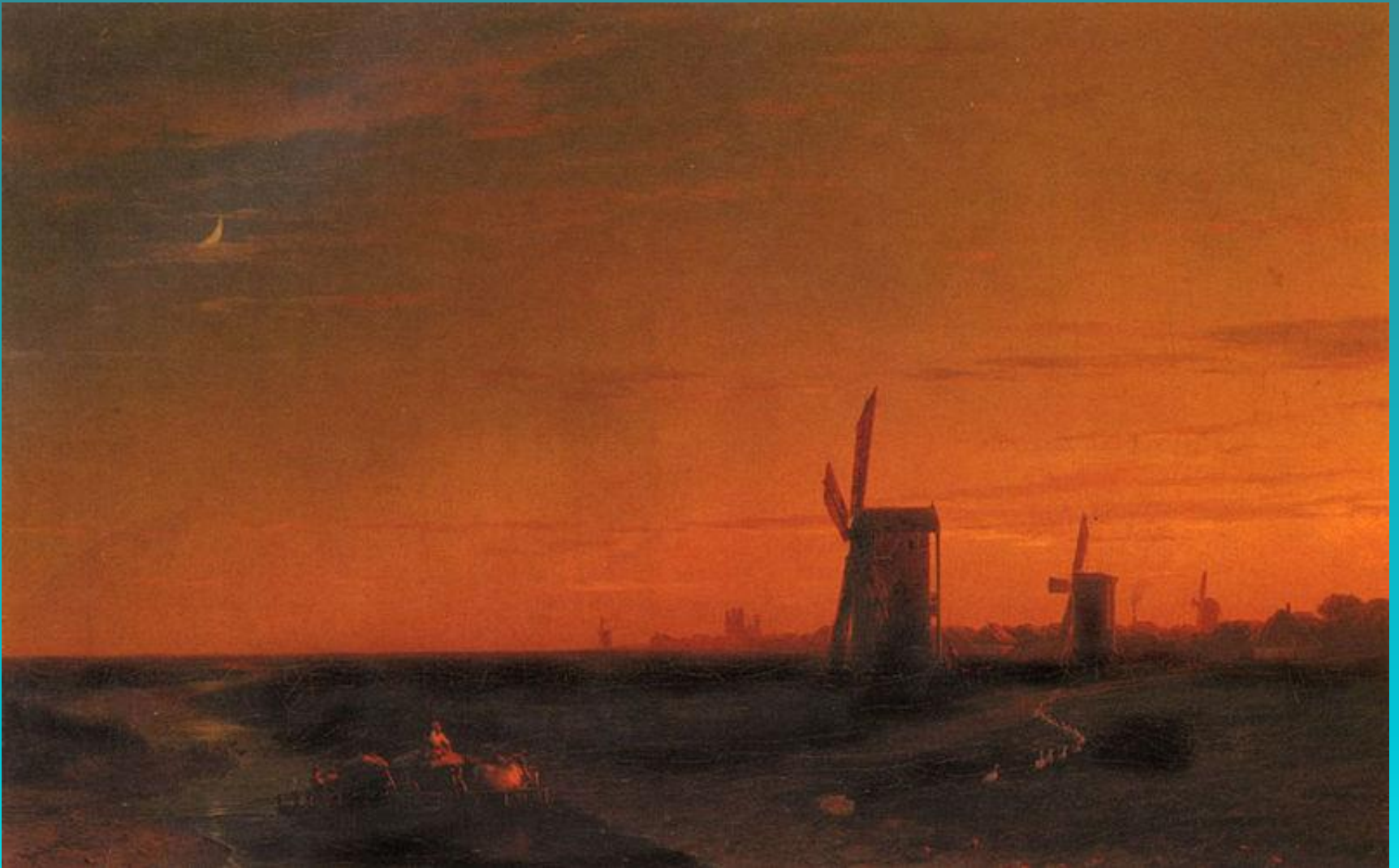
Landscape with windmills.