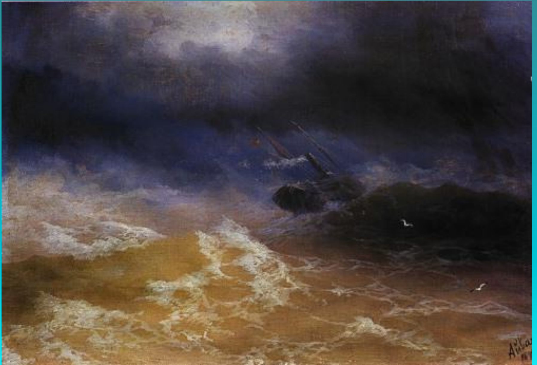
Storm at sea.