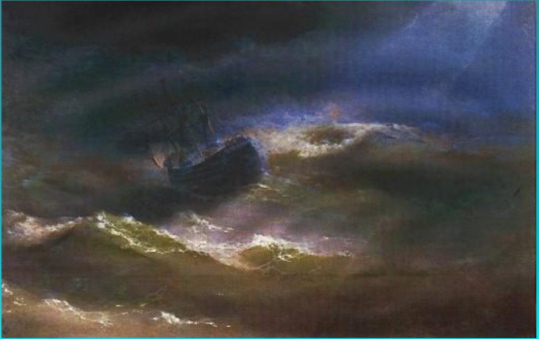
"Maria" in the storm.