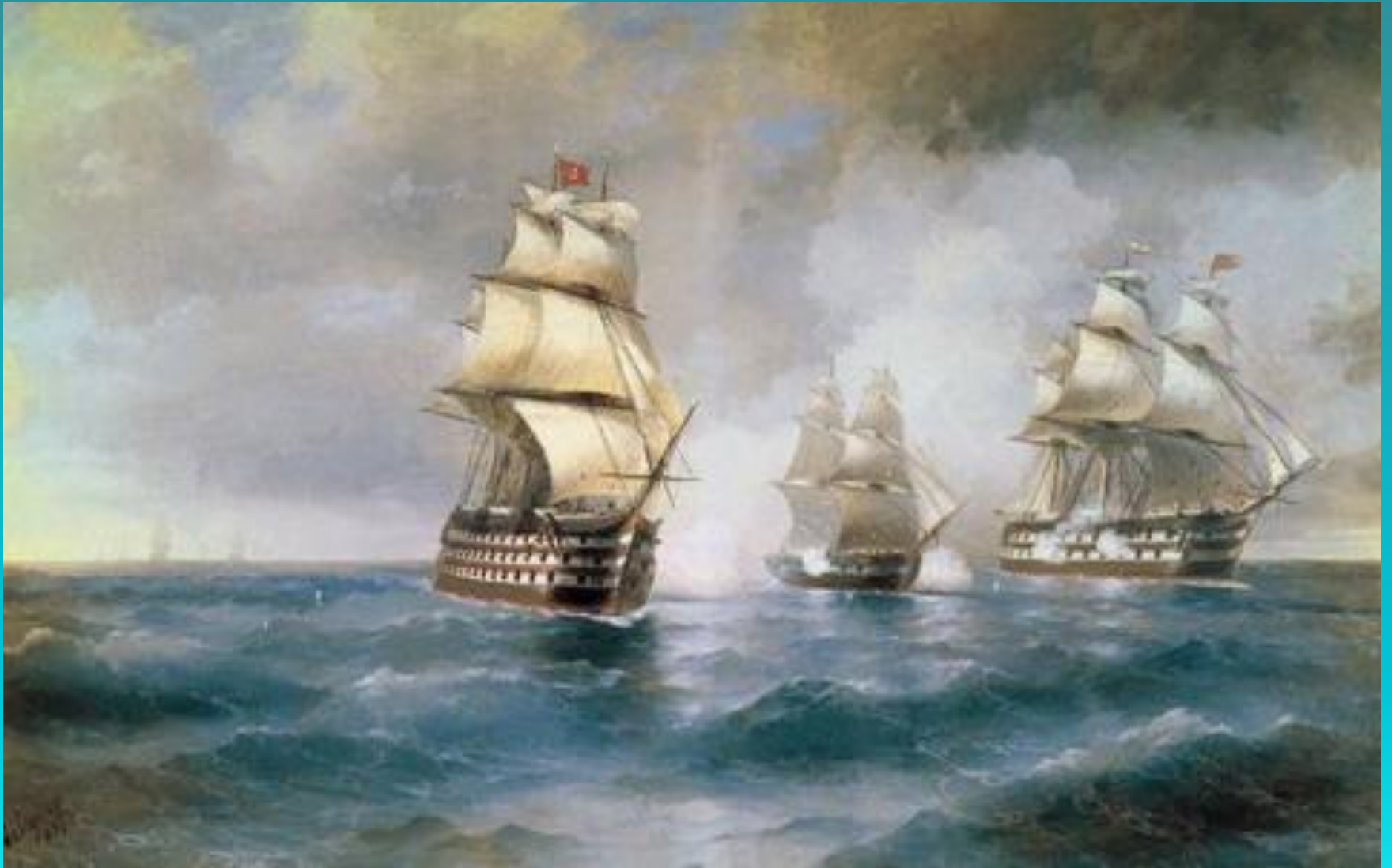
Brig "Mercury" attacked by two turkish ships