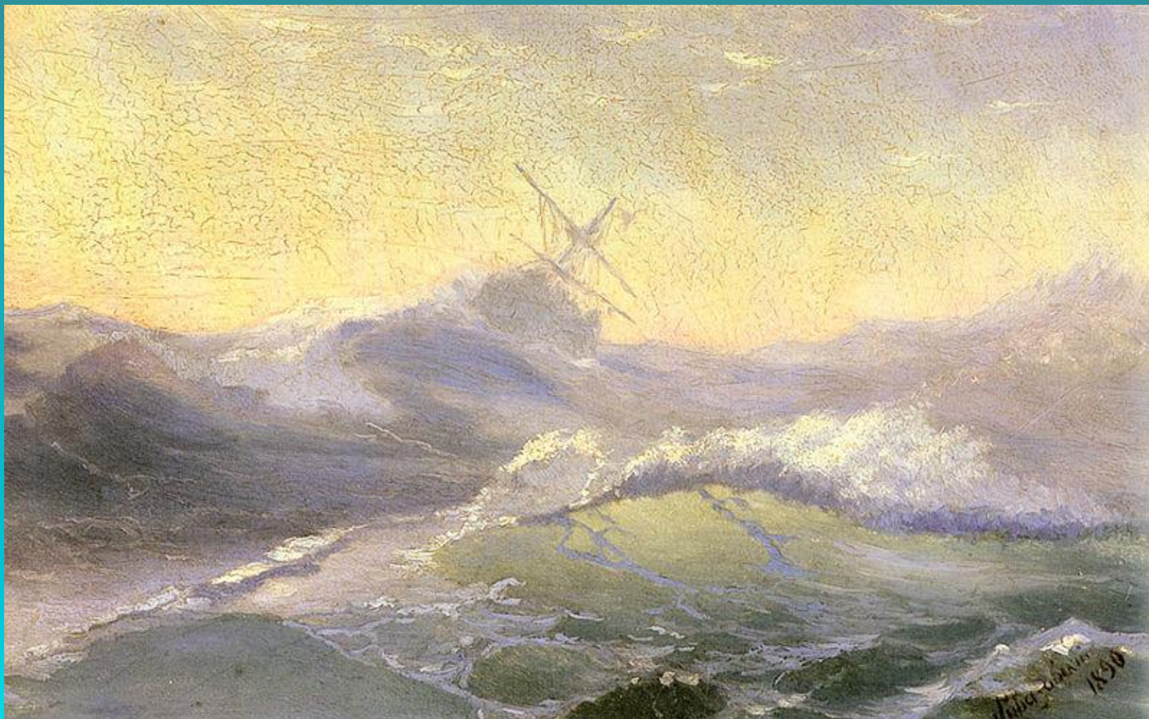
Бодрящая волна. Invigorating wave.