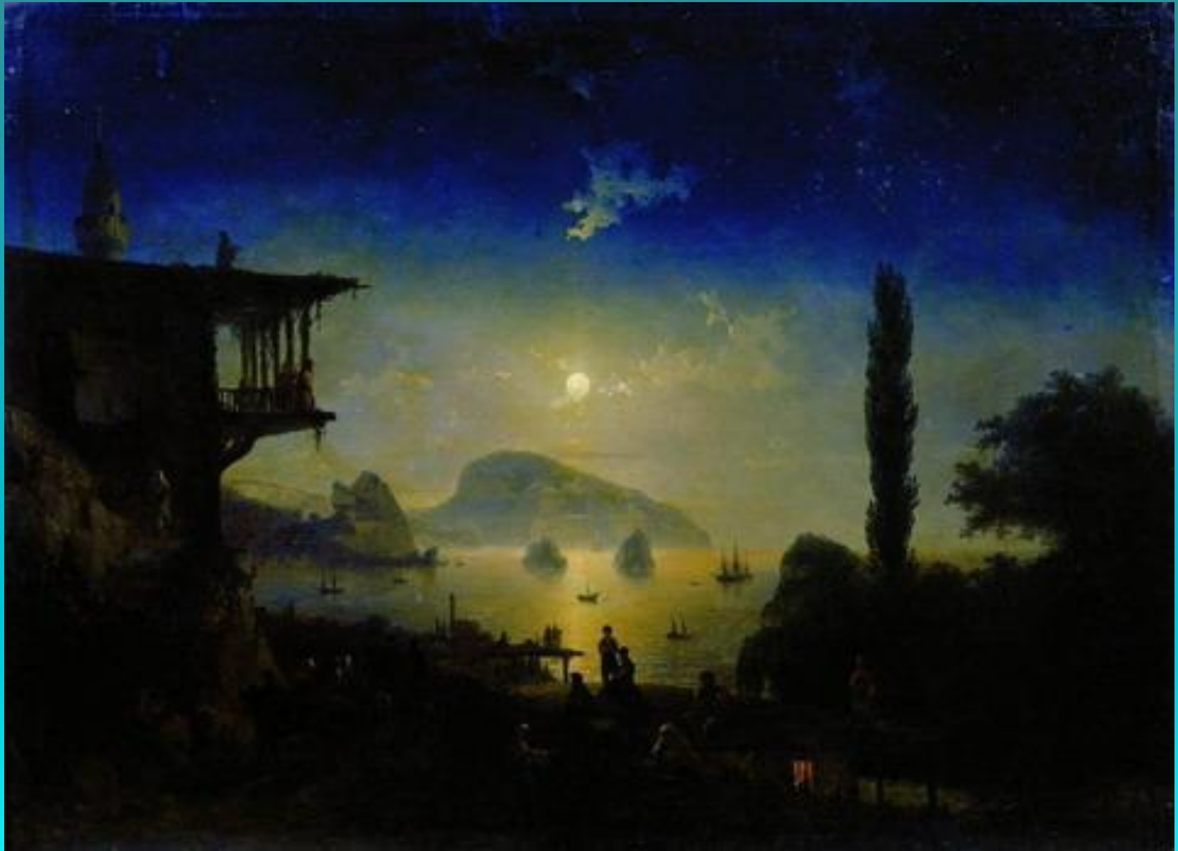
Moonlight night in the Crimea.