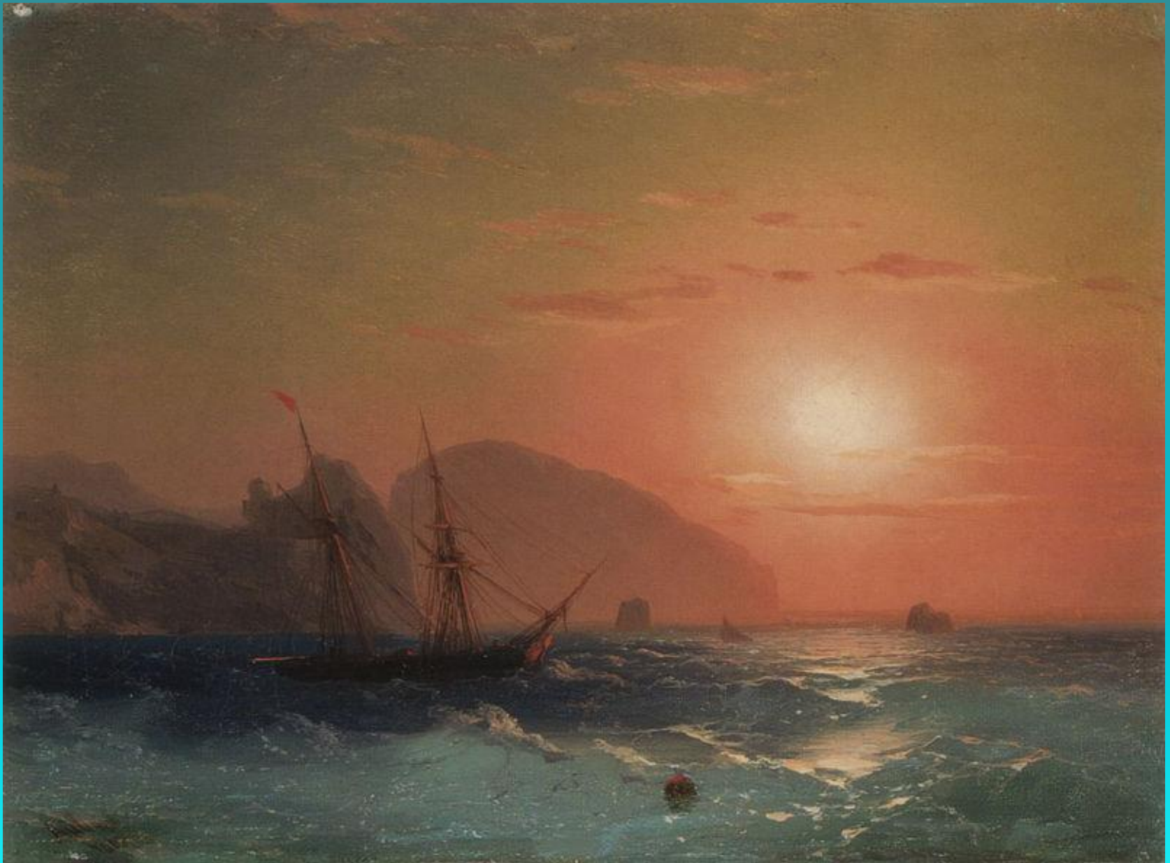
View on Ayu Dag