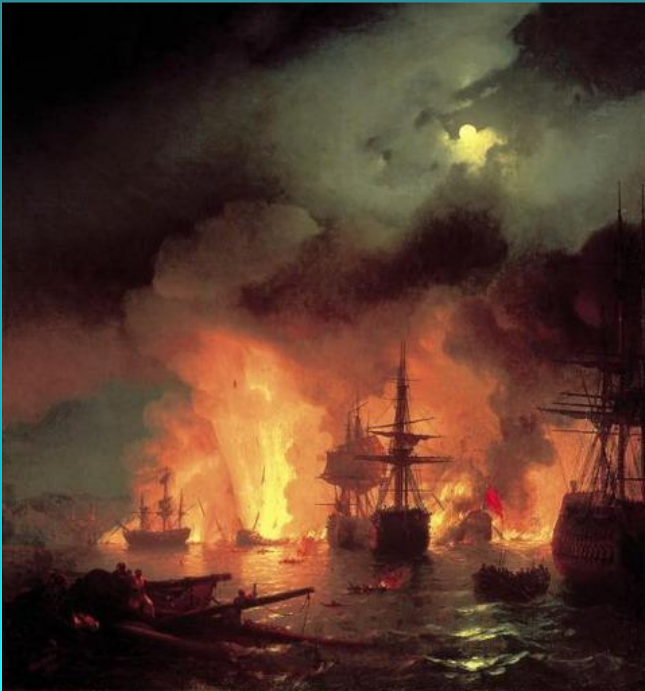
Battle of Chessmen'