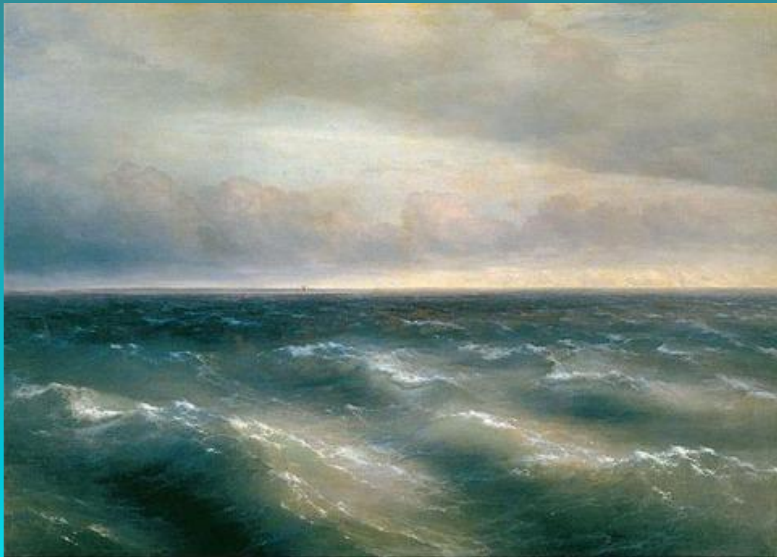
Black Sea. (kept in the Tretyakov Gallery)

The plot is simple - water, waves, and ... the sky. Somewhere in the distance a lone sail. Taken artist highest point of view makes it possible to create the illusion of movement of waves.