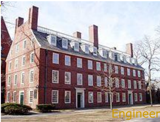
Massachusetts Hall (1720), Harvard's oldest building