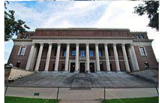
The Harry Elkins Widener Memorial Library