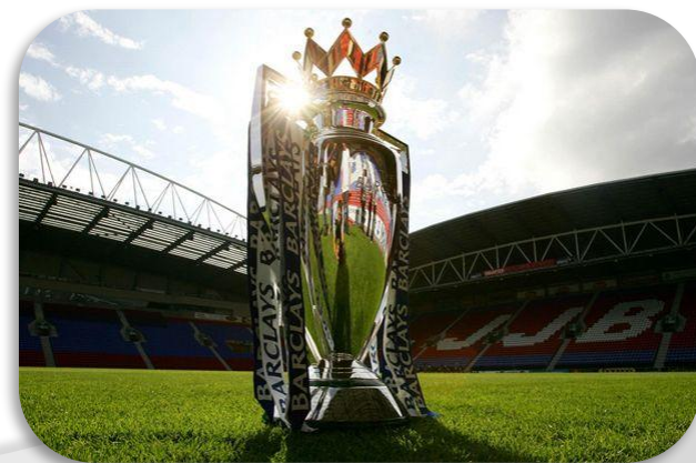
Premiere league Trophy