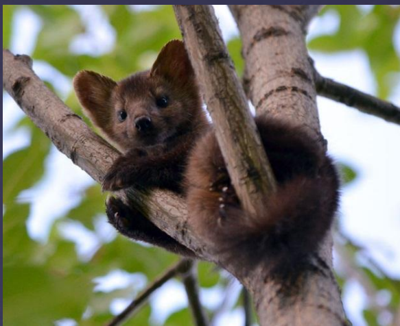
Sable - соболь