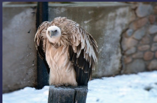
Snow vulture – қар жыртқышы