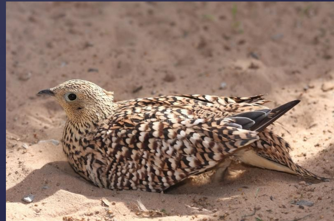
Sand grouse – құм қиыршықтары