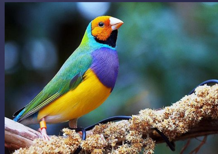
Finch - зяблик