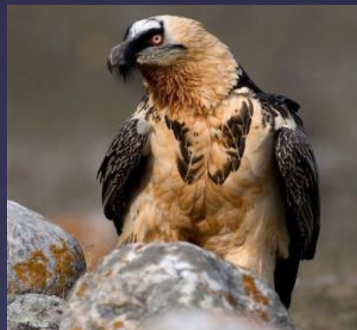
Lammergeyer - ламмергейер