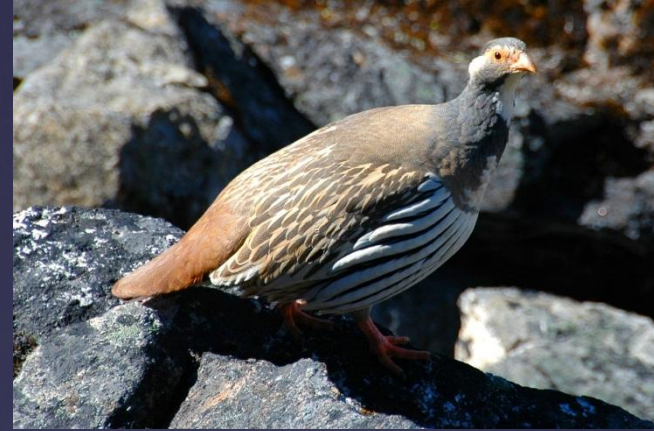
Snow cock – қар құмырасы