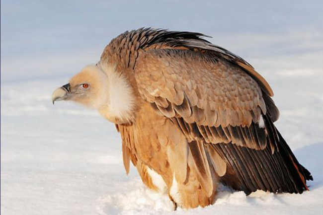
Griffon vulture – гриф жыртқышы