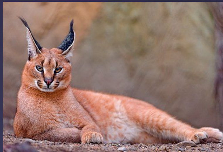
Caracal cat – каракал мысығы