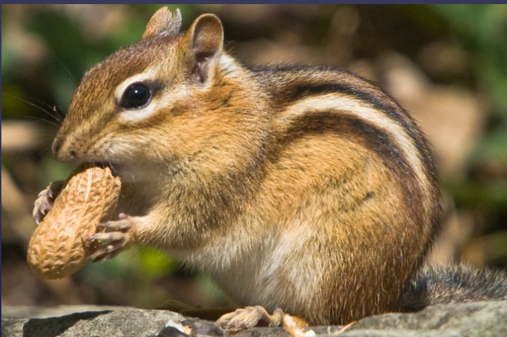
Chipmunk - бурундук