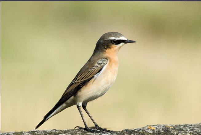
Wheatear - каменка