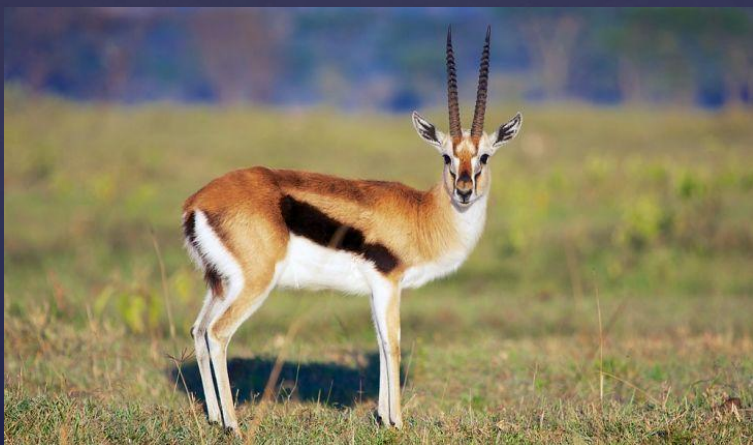
Gazelle - газель