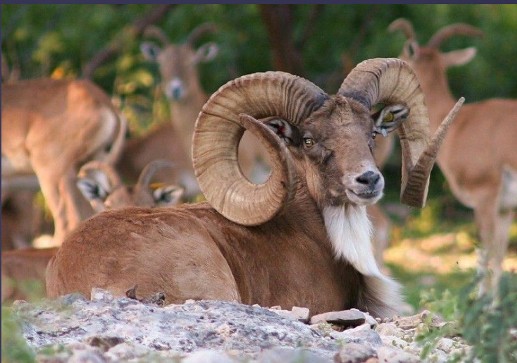
Transcasian urial – Транскаспийлік арқар