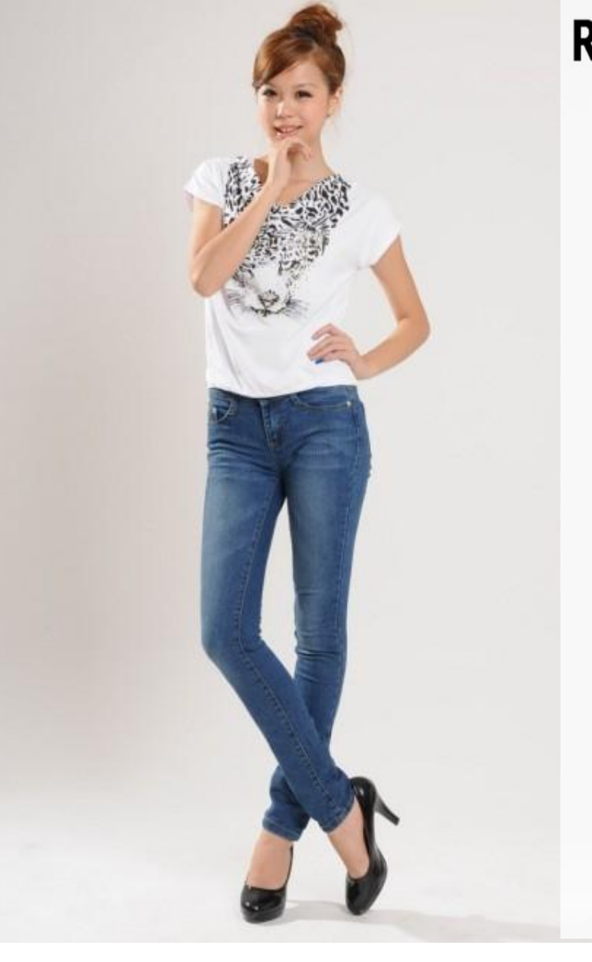
RaveJeans® +年品牌 专注牛仔