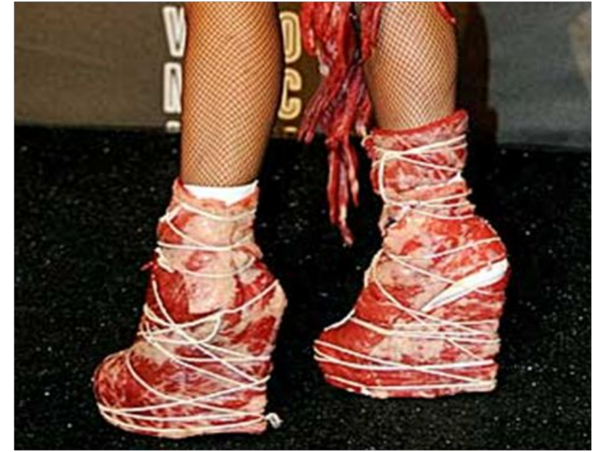
When the shoelaces come untied, is it dinner time for dogs?