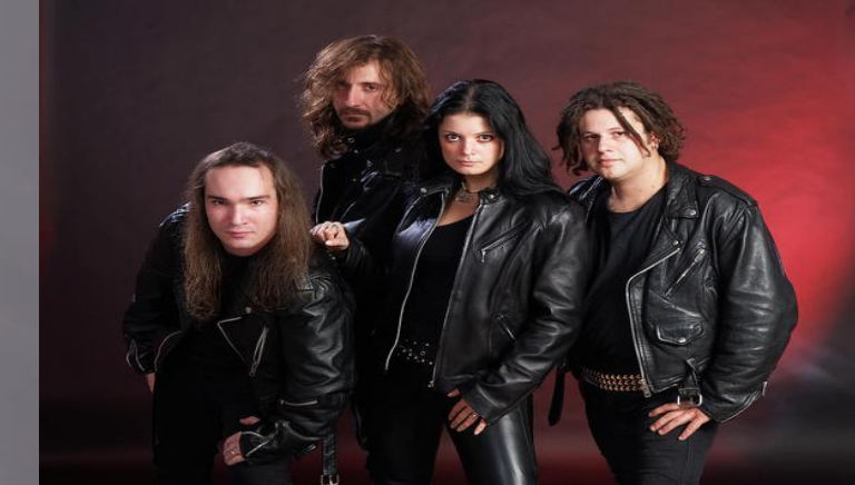
Image subculture rockers are practical, in principle, it survives today. They wear leather jackets decorated with various patches, iron buttons

Rockers subculture emerged in 1960 in England. Originally it was applied to the youth, who went on a motorcycle. The origins of the rocker, began to form as early as 1950, when the style of rock and roll began to gain momentum, thanks to the legendary performer Elvis Presley.