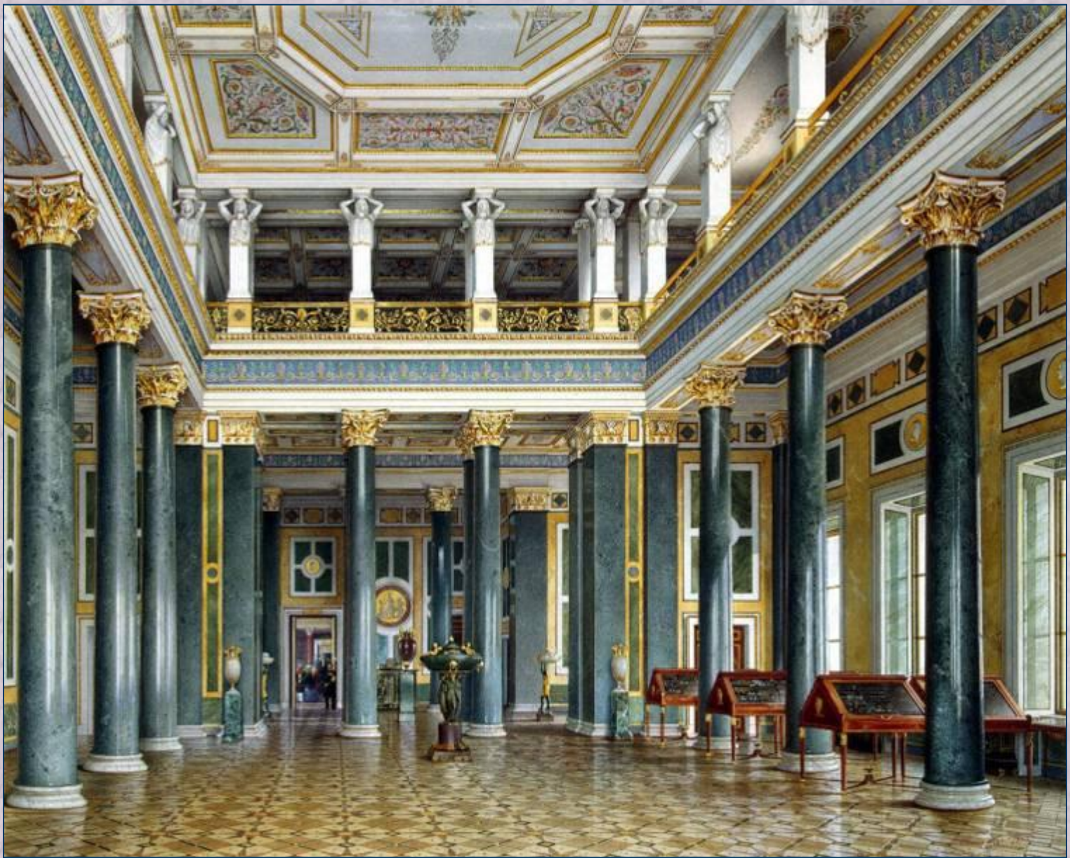
The Room Of Coins And Medals