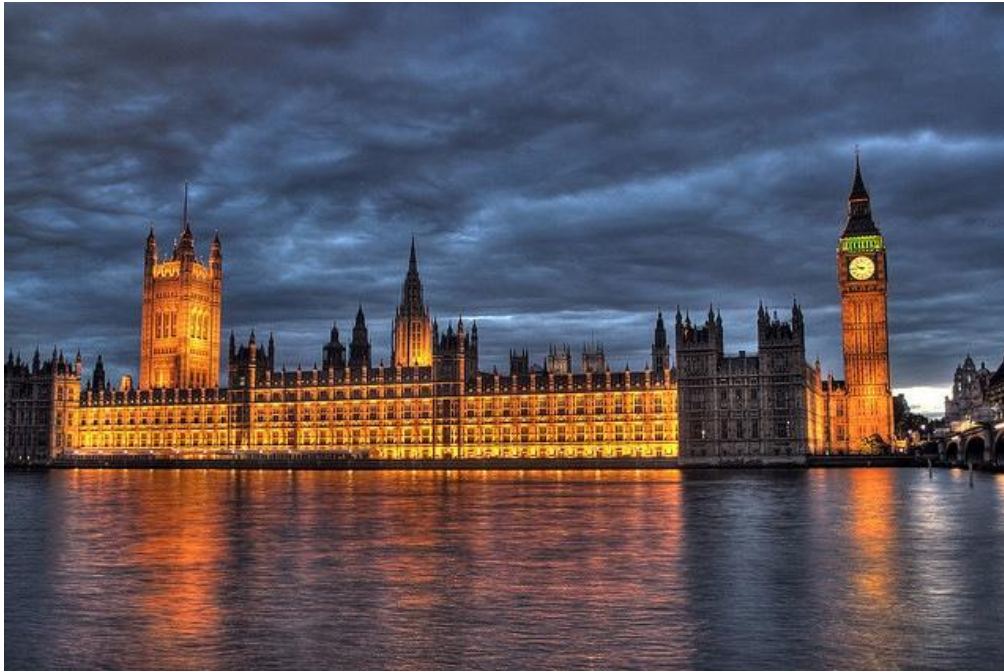
Houses of Parliament, London View of Victoria Tower to the left, and the Houses of Parliament and Big Ben to the right.