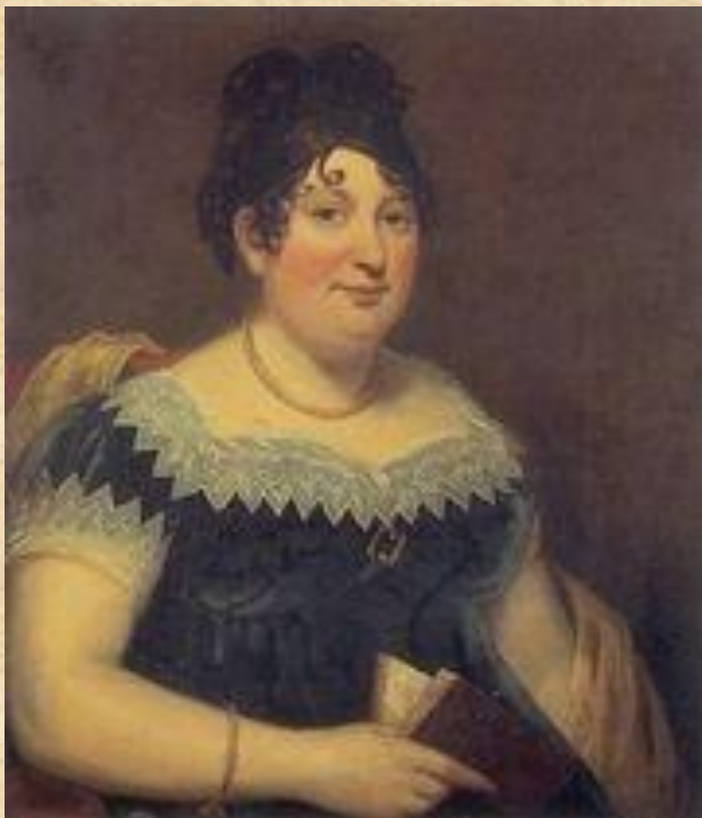
Миссис Байрон, мать Джорджа Гордона Байрона. Худ. Т. Стюардсон.