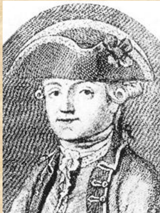
Капитан Джон Байрон, отец Джорджа Гордона Байрона. Гравюра