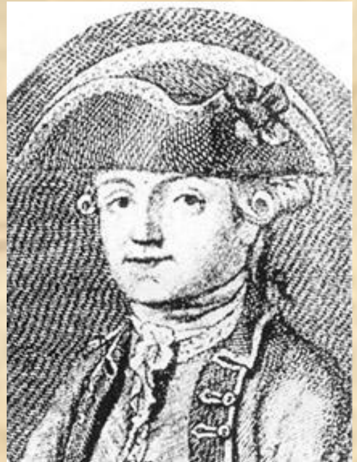
Капитан Джон Байрон, отец Джорджа Гордона Байрона. Гравюра