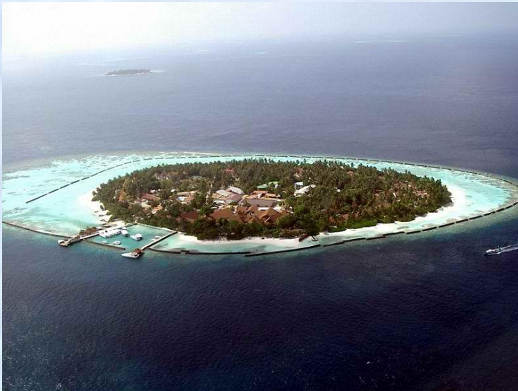
Kurumba Island, Maldives