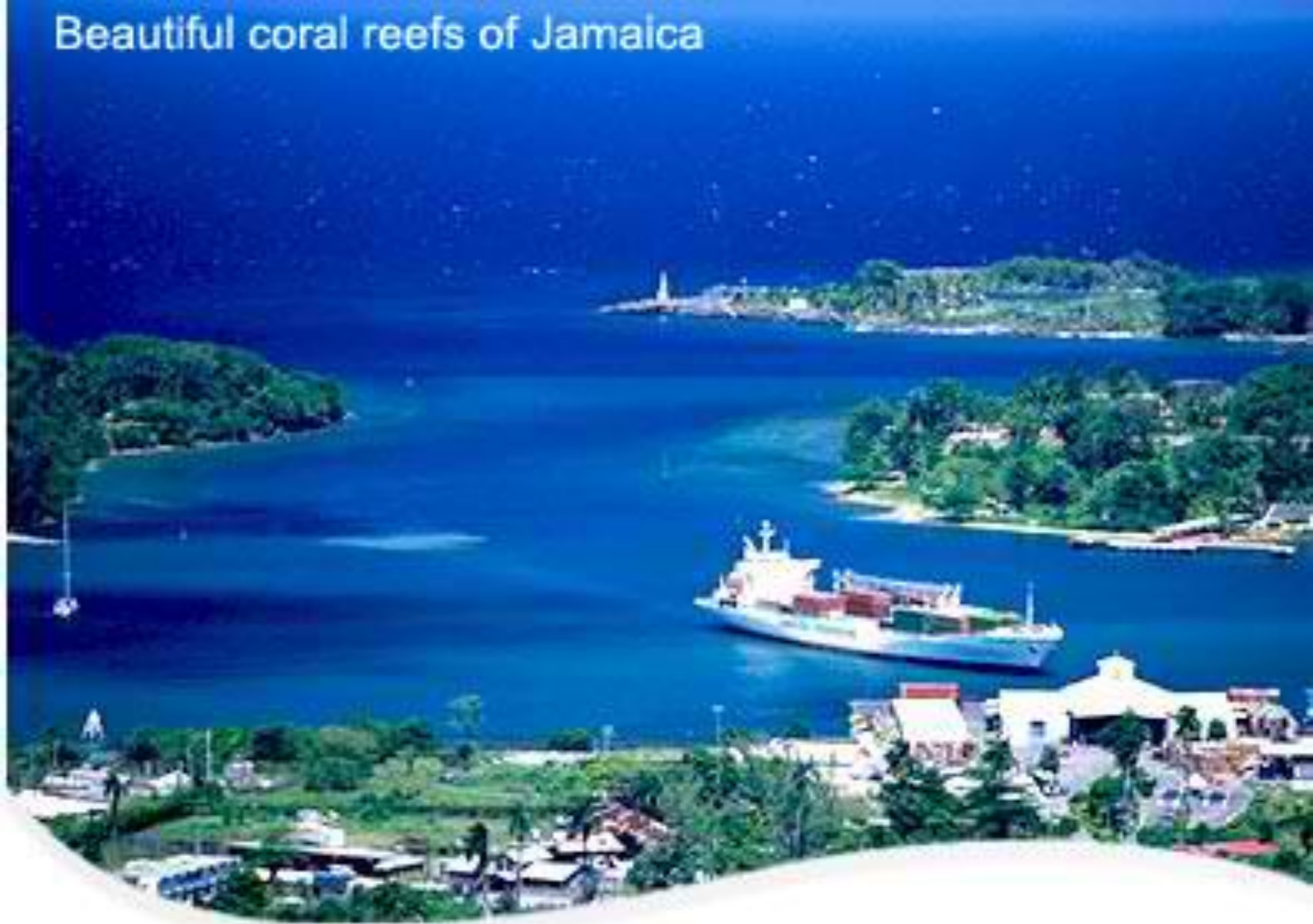
Beautiful coral reefs of Jamaica