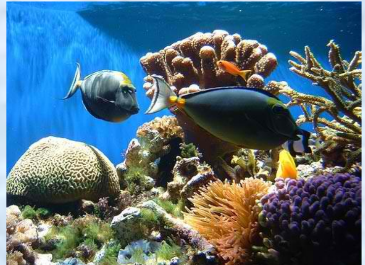
Jamaican coral reef scene