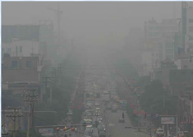
Linfen, China The most polluted city in the world