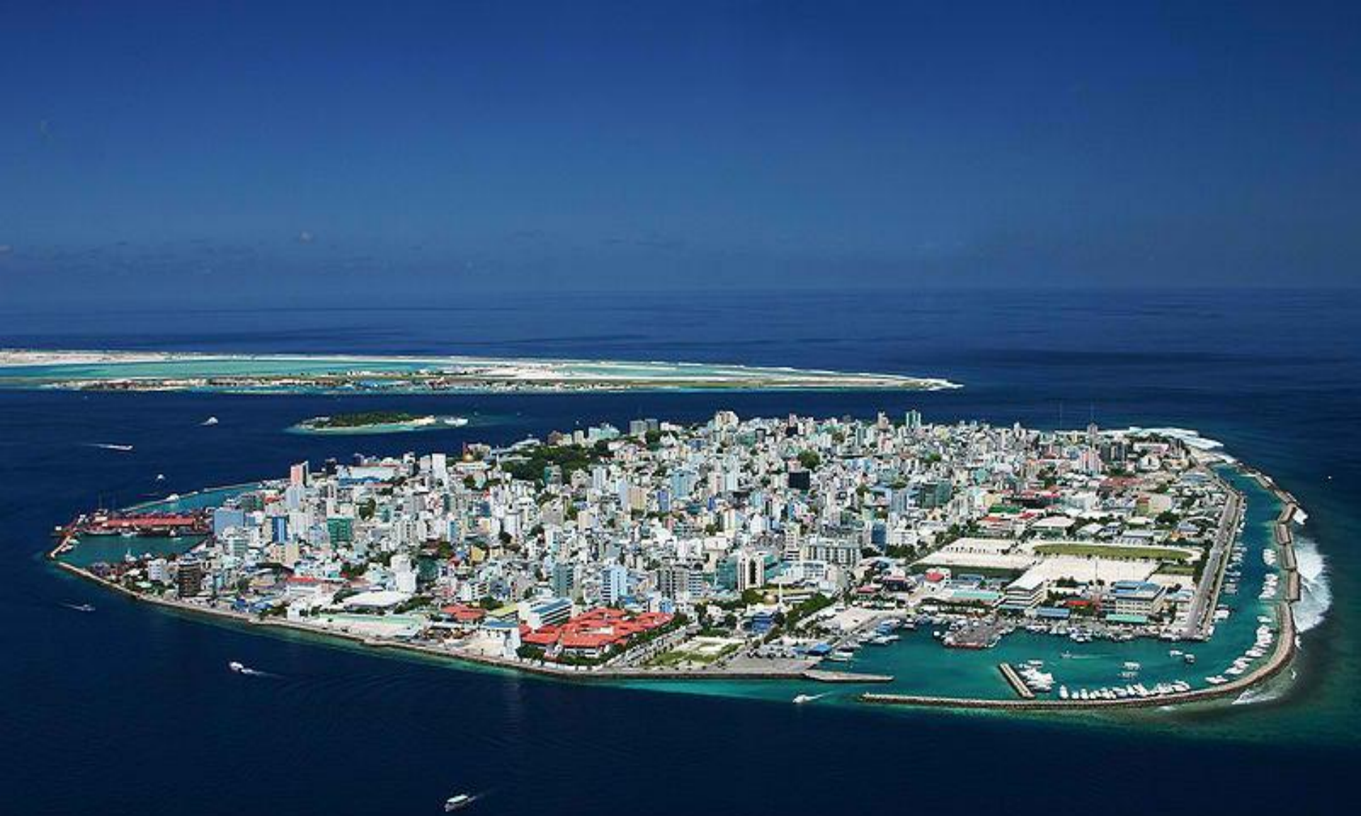
Malé, the capital of the Maldives