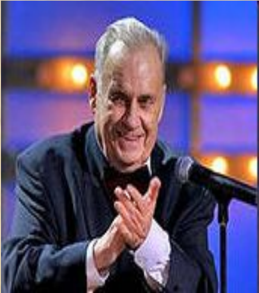
Eldar Ryazanov 1927 -