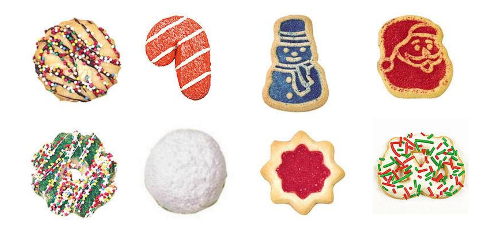
Christmas Cookies (Left to right, top to bottom: Eggnog Cookie, Candy Cane Cookie, Snowman Cookie, Vanilla Santa, Shortbread Wreath, Pfeffernüsse, Cherry Snowflake and Holiday Pretzel)