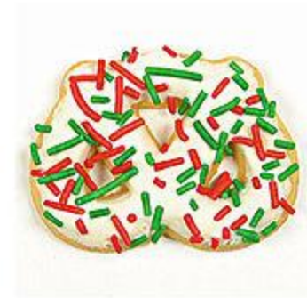
Christmas Cookies (Left to right, top to bottom : Eggnog Cookie, Candy Cane Cookie, Snowman Cookie, Vanilla Santa, Shortbread Wreath, Pfeffernüsse, Cherry Snowflake and Holiday Pretzel)