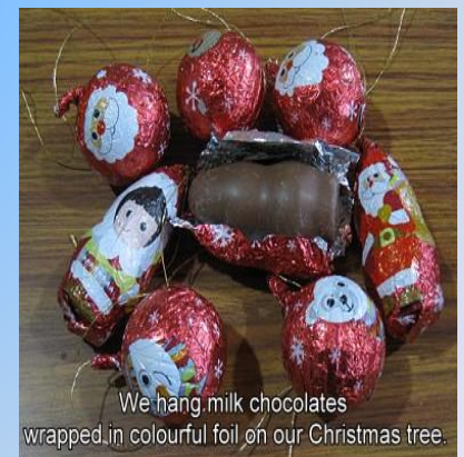
We hang milk chocolates wrapped in colourful foil on our Christmas tree.